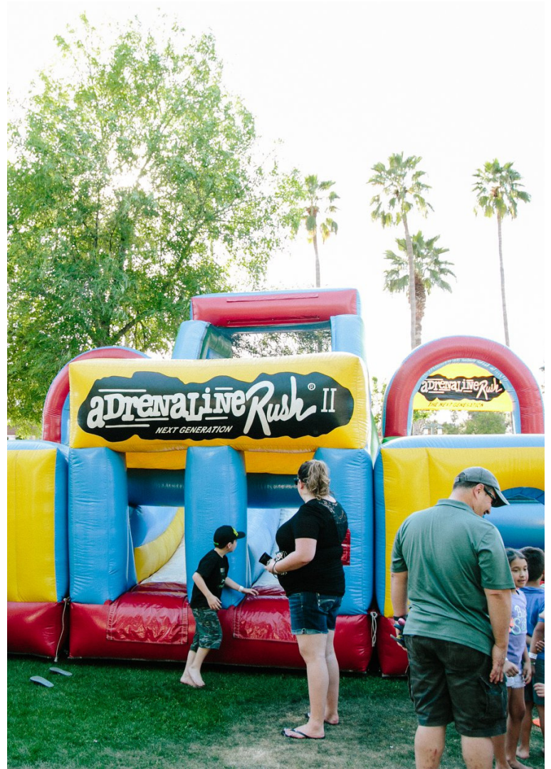
KNIX BBQ & Beer Festival

If you wish to close down a street in the Downtown, the DCCP can help facilitate this with City Staff, Police and Fire.