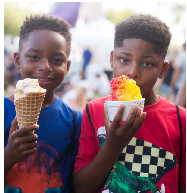
KNIX BBQ & Beer Festival

When you choose to partner with the DCCP as the 25% non-profit alcohol recipient for your event, we'll do the heavy lifting on submitting special event applications and obtaining alcohol permits from both the City of Chandler and the State of Arizona. We'll also use our own liability insurance so that you don't have to pay to do so.