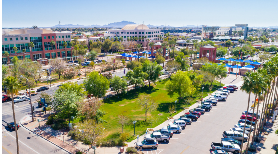
Dr. A.J. Chandler Park West

Located in the heart of the Downtown Chandler historic district, Dr. A.J. Chandler Park West is centrally located to some of our finest dining, retail shops and hotels. The park boasts two electric panels and has the capability to accommodate a lighter, portable stage.