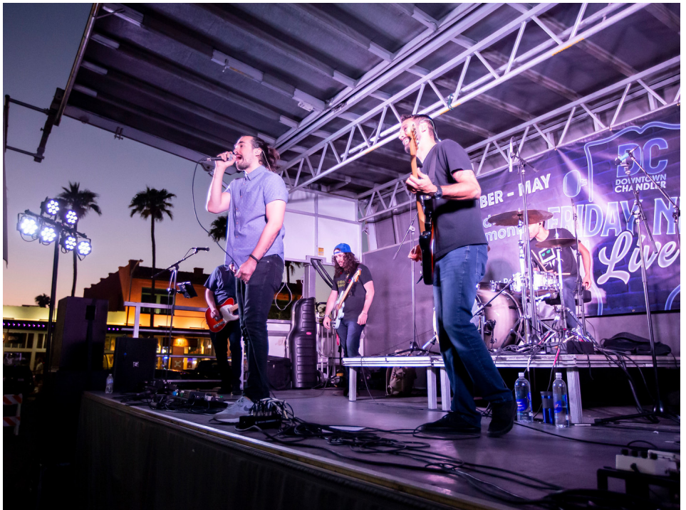
Downtown Chandler Friday Night Live