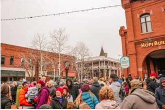
NEW YEARS EVE