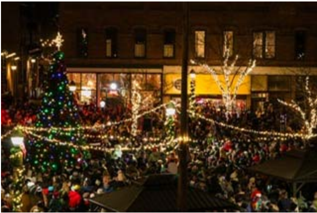
NOON YEARS EVE