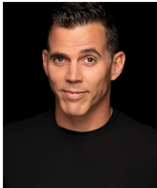
Steve-O • 7/5 - 7/7