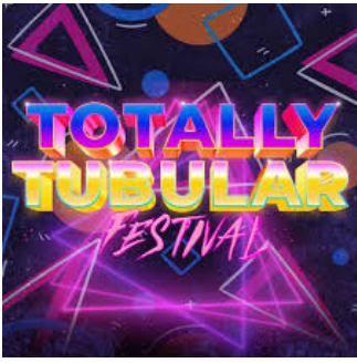
Totally Tubular Festival • 7/3

TOTALLY TUBULAR FESTIVAL Arizona Financial Theatre: With Thomas Dolby, Thompson Twins, Modern English, Men Without Hats, The Romantics, and Bow Wow Wow. $53 - $246. 6:00 PM. 400 W Washington St 602-379-2800 livenation.com