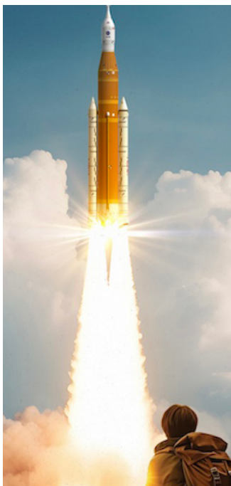
Space: The New Frontier • Daily

Arizona Science Center: Included with general admission. Daily 12:00 PM & 2:00 PM. 600 E Washington St 602-716-2000 azscience.org