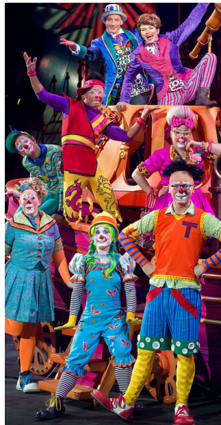
Ringling • 7/5 - 7/7

KARAOKE MONDAY Sazerac: No cover. 8:00 PM. 821 N 2nd Ave 602-334-1626 sazeracphoenix.com