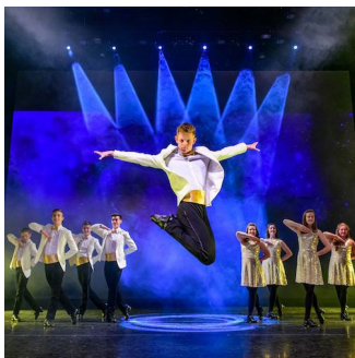
Celtic Throne • 7/1

CELTIC THRONE Herberger Theater Center: Created by Herbert W. Armstrong College, Celtic Throne celebrates the mysterious origins of Irish dance. Center Stage. $30 - $50. 7:30 PM. 222 E Monroe St 602-254-7399 herbergertheater.org