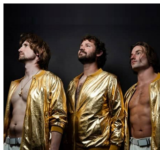
You Should Be Dancing - A Tribute to The Bee Gees • 7/7

Footprint Center: See page 1 for more details. $25 - $140. 11:00 AM & 3:00 PM.