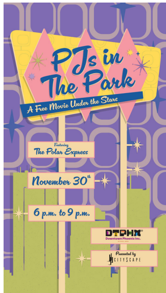
PJs In The Park • 11/30