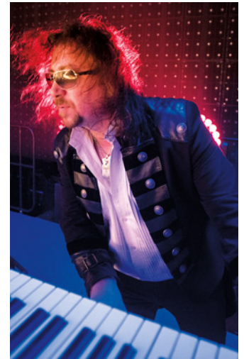
Trans-Siberian Orchestra • 12/1

TRANS SIBERIAN ORCHESTRA Footprint Center: The Lost Christmas Eve Tour. $59 - $119. 3:00 PM & 7:30 PM. 201 E Jefferson St footprintcenter.com/events