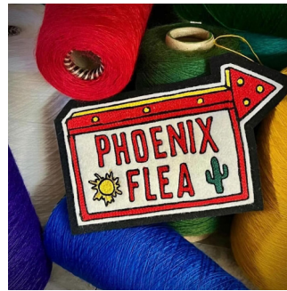
Phoenix Flea • 11/30

CREATOR COURSE: WOOD SHOP Arizona Science Center: $150. 10:00 AM - 1:00 PM. 600 E Washington St azscience.org