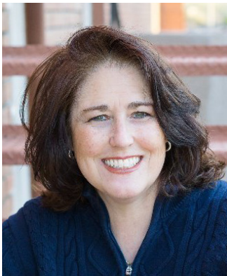
Crack Ups Comedy Night • 11/29

CRACK UPS COMEDY NIGHT Tap That Downtown: No cover. 7:30 PM. 909 N 5th St tapthatbeer.com