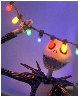
The Nightmare Before Christmas 11/26

Japanese Friendship Garden: $50. 9:30 AM & 11:00 AM. 1125 N 3rd Ave jfgphx.org