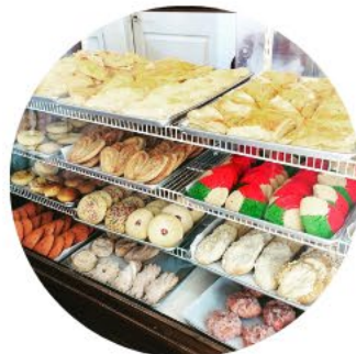
La Estrella Bakery 141 S Stone Ave.