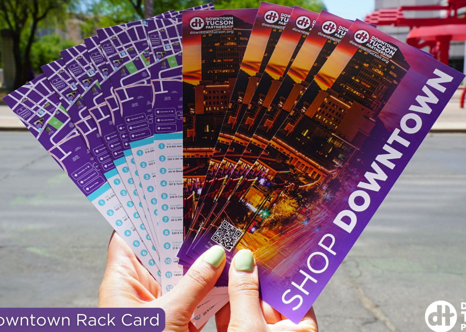
Shop Downtown Rack Card