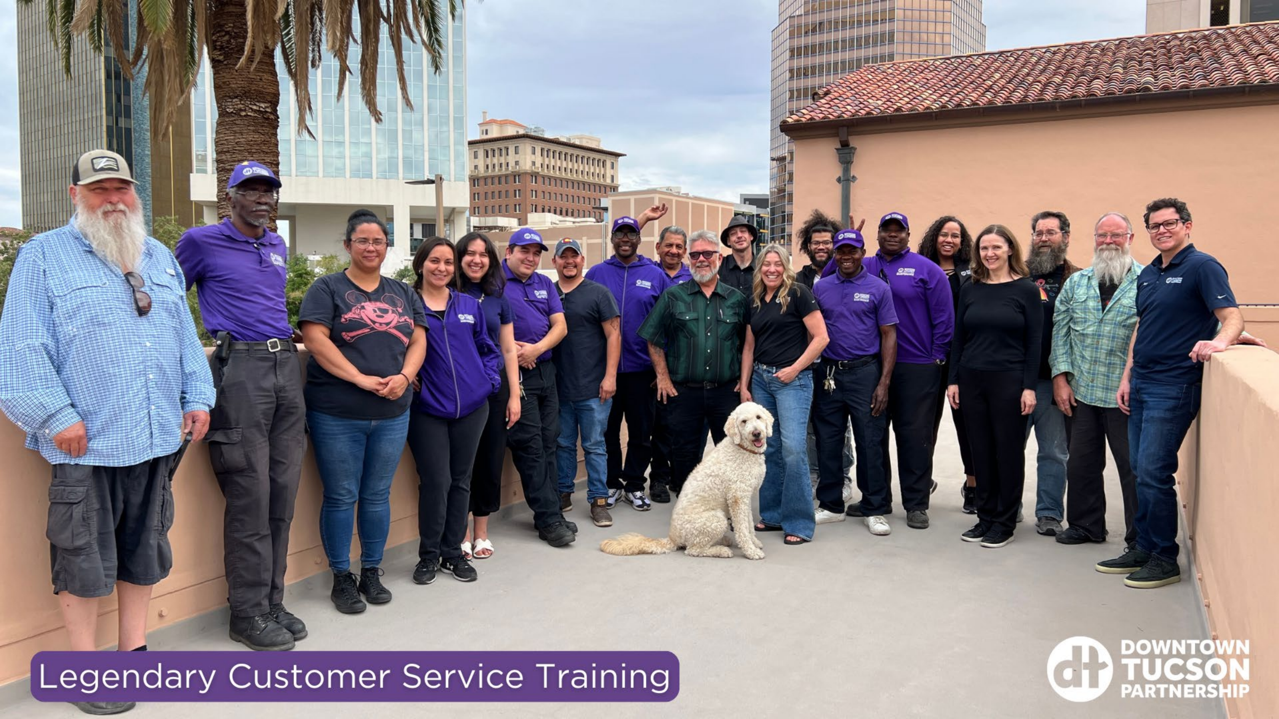
Legendary Customer Service Training