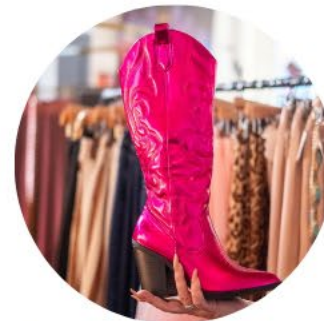
Goddess Garage 300 E Congress St.