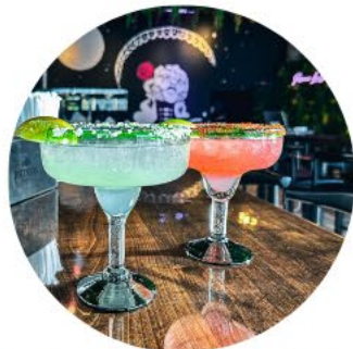
Chela's Latin Cuisine 256 E Congress St.