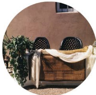
House of Oye 267 S Stone Ave.