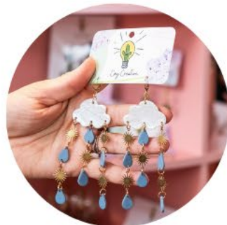
Coy Creative 300 E Congress St.