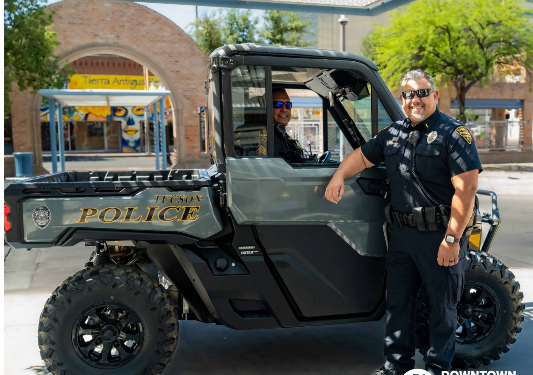
Downtown Traffic Safety Taskforce