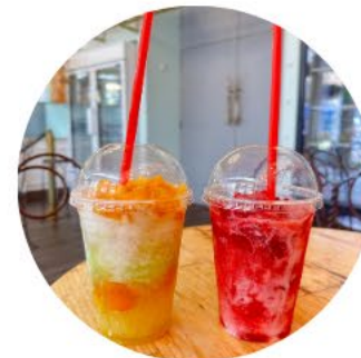
Raspaderia El Sahuaro 245 E Congress St.