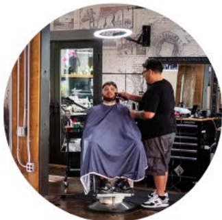
1972 Barber & Shave Parlor 300 E Congress St.