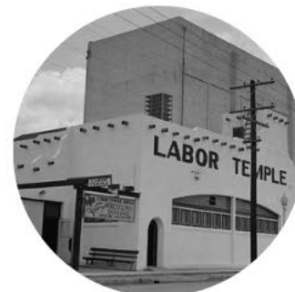
The Sound Post: Tucson Folk Center 267 S Stone Ave.