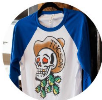
Sparrows & Sombreros 300 E Congress St.