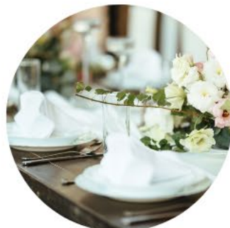
The Grand at Gibson Court 33 S 6th Ave.