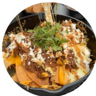
Sonora Moonshine Co. 124 E Broadway Blvd.