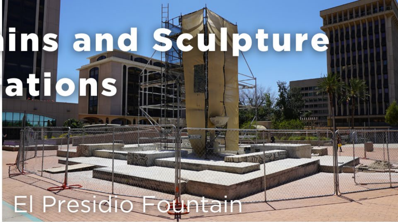
El Presidio Fountain