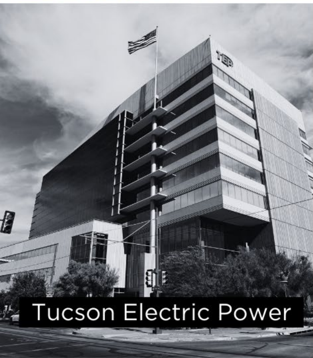
Tucson Electric Power