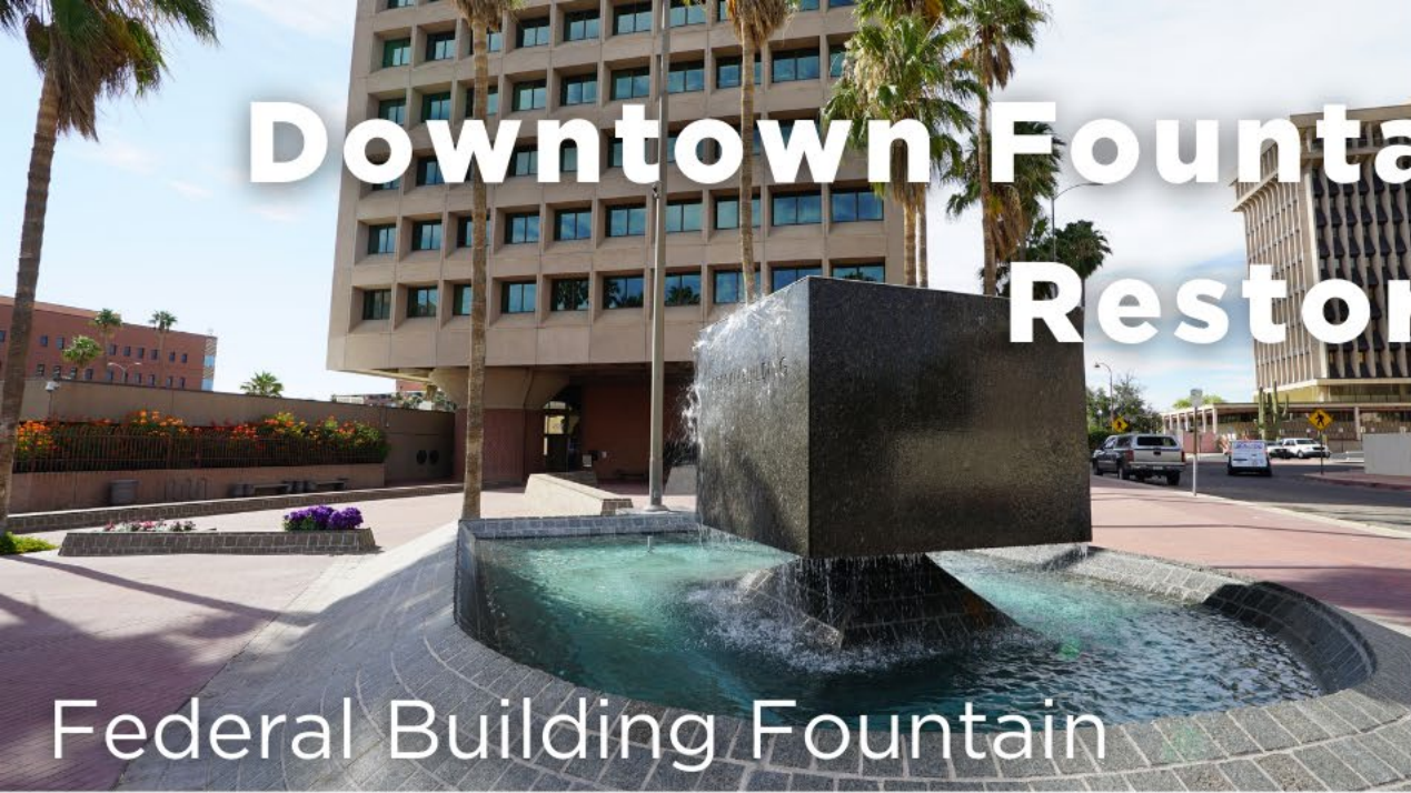
Federal Building Fountain