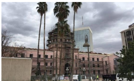
Pima County Courthouse

The 44 low-income housing project on Stone Avenue across from the Police station will be completed by the end of February. Portions of the original historic property remain and will be used for the office and lobby areas. A new 4-story addition has been constructed at the rear of the property to allow for covered parking on the ground floor.