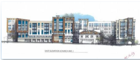
La Placita Village

The 40-year-old hotel on Cushing Street west of I-10 will receive a $2.2 million renovation that will include new finishes, furniture, fixtures, and bathrooms, plus upgrades to heating and cooling and the addition of sliding glass doors. The project will retain the building's charm while bringing it up to par with name brand hotels, and it will also make the hotel more competitive for conventions in downtown.