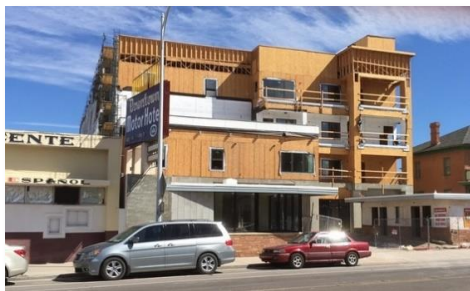
Downtown Motor Apartments

"Luxury Urban Living." Construction is nearing completion on the 25 new multi-story, market-rate apartment complex across from St. Augustine Cathedral on Stone Avenue. Different floor plans are available and all units come with a garage. The project is expected to be completed in spring 2017.