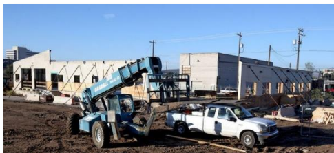
7th Ave Commons

HSL Properties was approved for a GPLET in March. Demolition of the 1973 property is scheduled to begin by the end of May, and a 6-story building with 240 apartments and ground-floor retail will be constructed in its place.