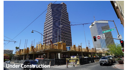
Rendezvous Urban Flats

DoubleTree by Hilton at the TCC - Caliber Group (Hospitality) broke ground on a $20 million, 170-bed full-service DoubleTree branded hotel on the east side of the TCC. The hotel will include a banquet hall, meeting rooms, full-service bar, and restaurant. Rio Nuevo will build a 350 space parking garage adjacent to the hotel on the current Lot A parking.