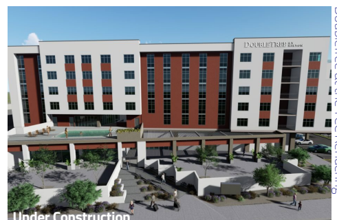
DoubleTree at the TCC Rendering