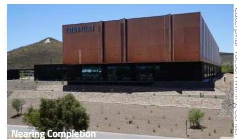
Caterpillar Tucson Mining Center