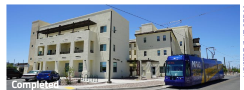
West End Station