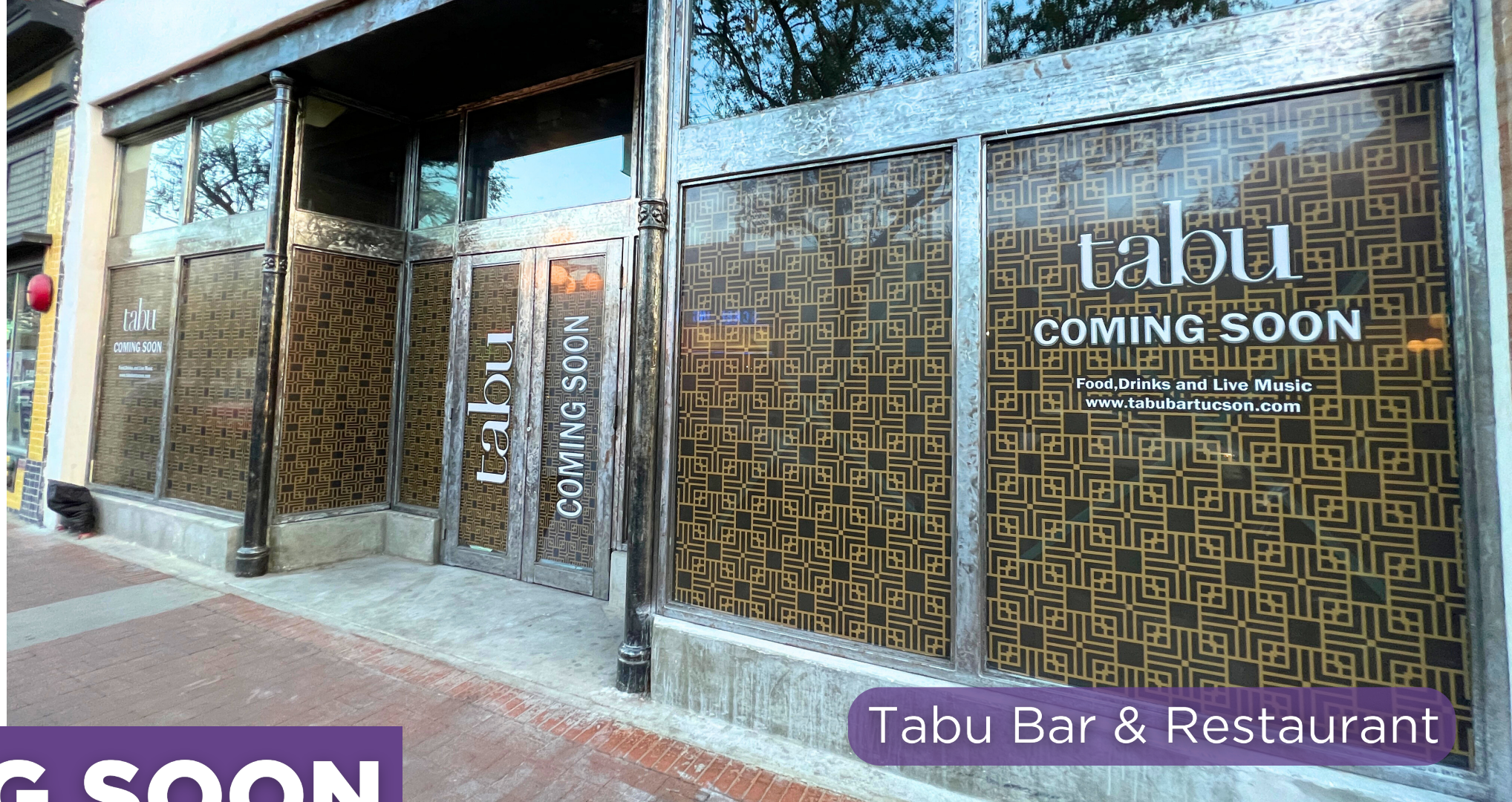
Tabu Bar & Restaurant