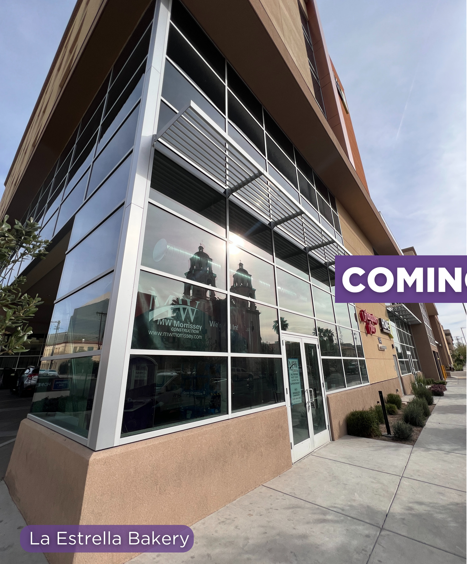
La Estrella Bakery