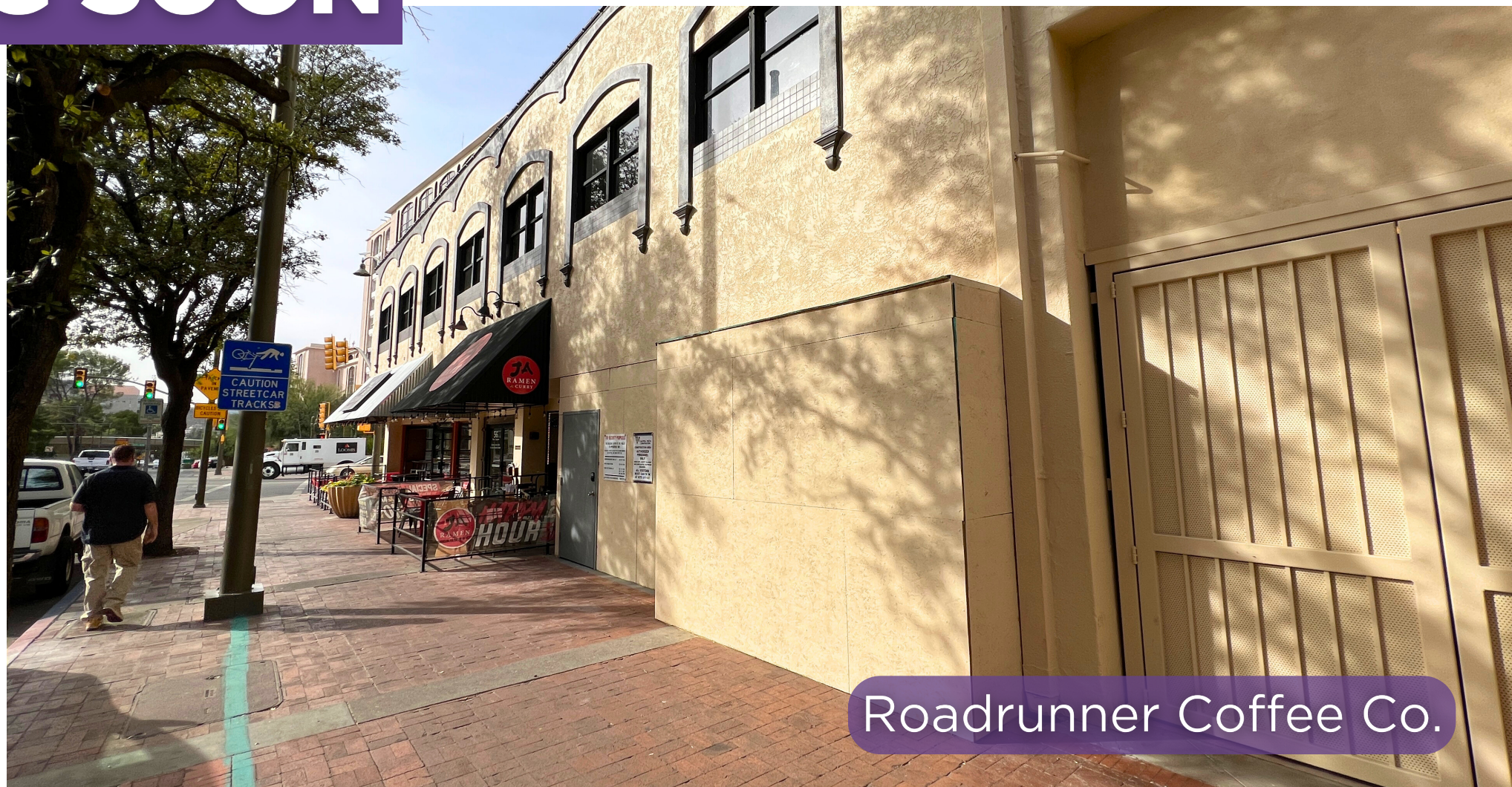
Roadrunner Coffee Co.