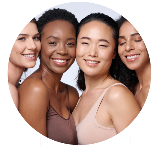
Z Beauty Bar