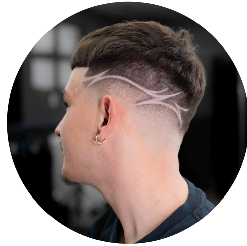
La Familia Barbershop