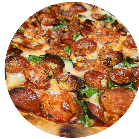
Jaime's Pizza Kitchen