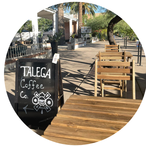
Talega Coffee Co.