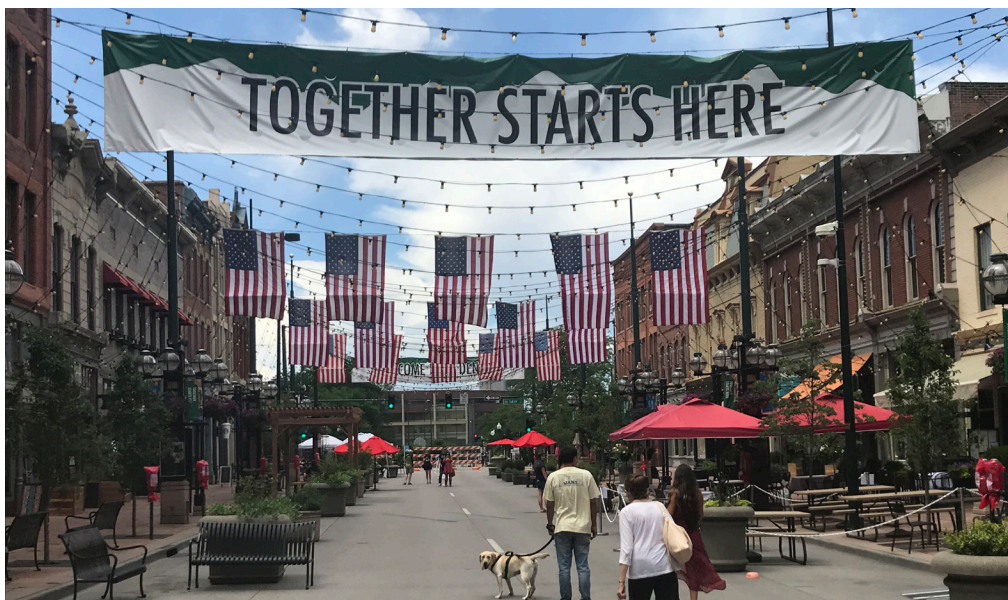
Downtown Denver, Larimer Square, July 2020

Fixed-route transit use was declining prior to the pandemic, reinforcing the need for transit to be part of larger integrated mobility systems along with point-to-point alternatives. During the pandemic, communities have had an opportunity to test routes for safer bicycle and pedestrian movement, thereby helping to accelerate the trend to diversify beyond autos moving forward.