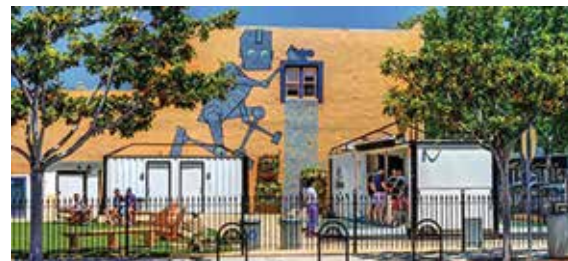
M3 The Robot - by TEKST (Choice @ 430 Carlsbad Village Drive)