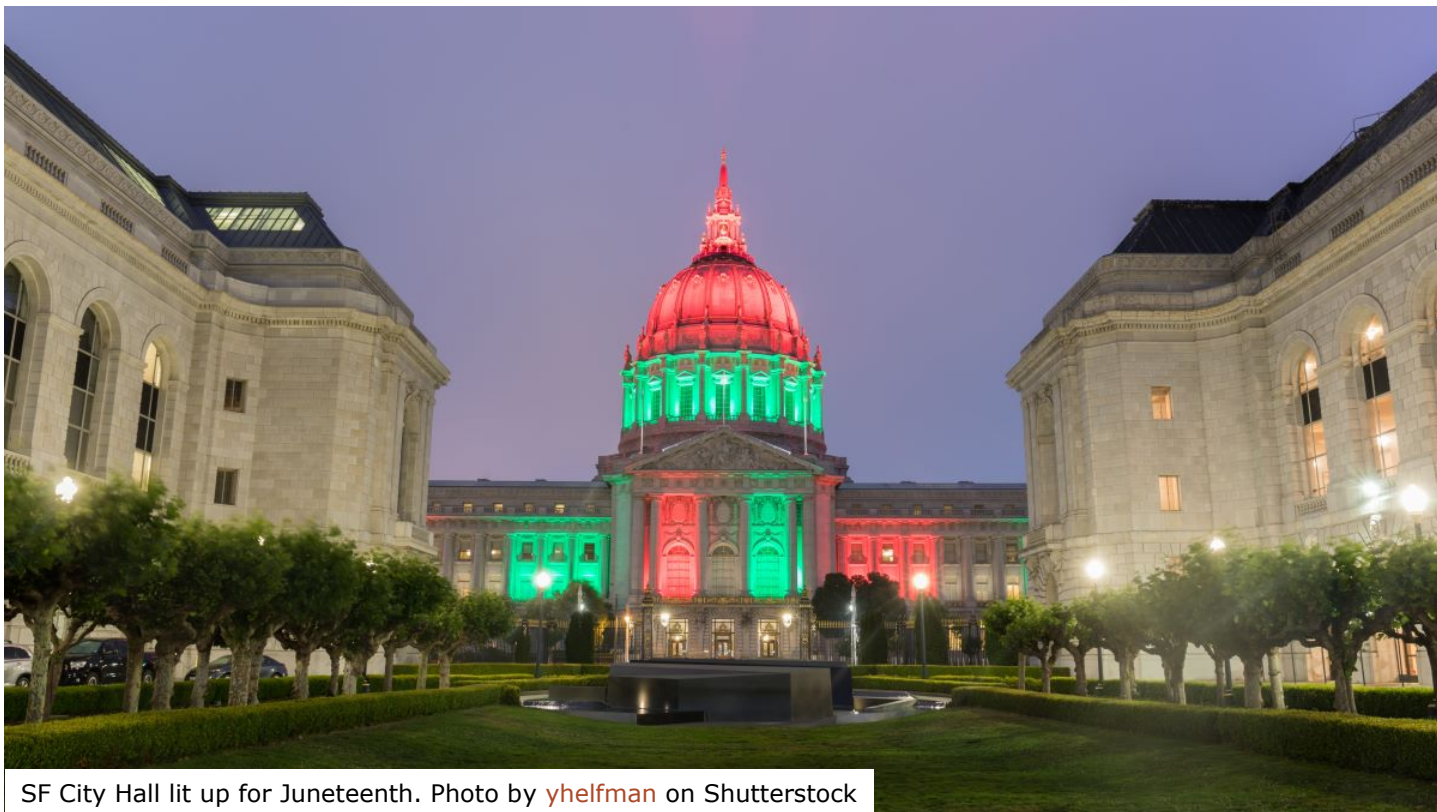
SF City Hall lit up for Juneteenth.