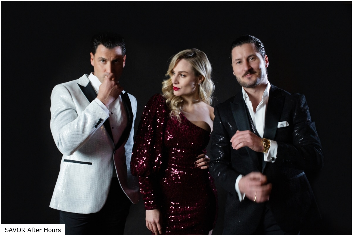
SAVOR After Hours

From June 3 to September 3, SAVOR After Hours is bringing a unique show that combines wine tasting with cabaret to Napa Valley's JaM Cellars Ballroom. The show features dances, close-up magic, illusions, and much more. Sip your way through delicious wine flights while enjoying performances from Maks and Val Chmerkovskiy of Dancing with the Stars .