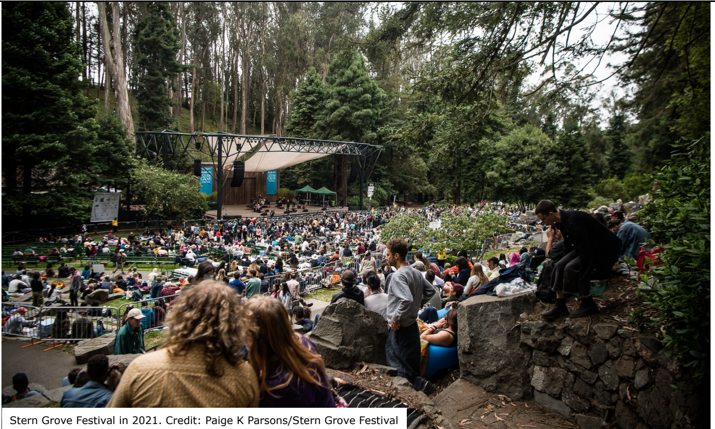
Stern Grove Festival in 2021.

Who's ready to see some live music?! Stern Grove Festival, a FREE outdoor concert series featuring a wide variety of genres, has just released its summer lineup. Here's what's on for June: