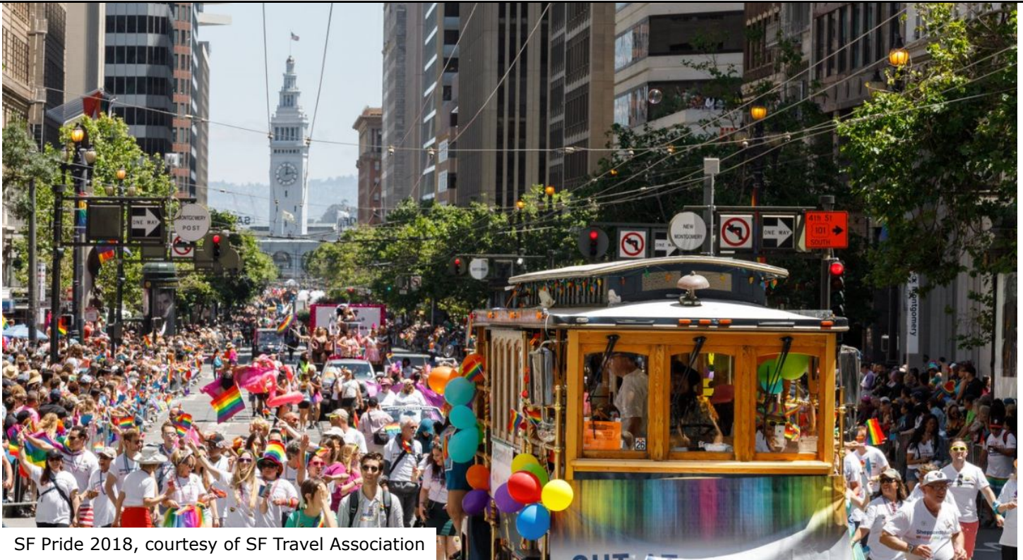
SF Pride 2018