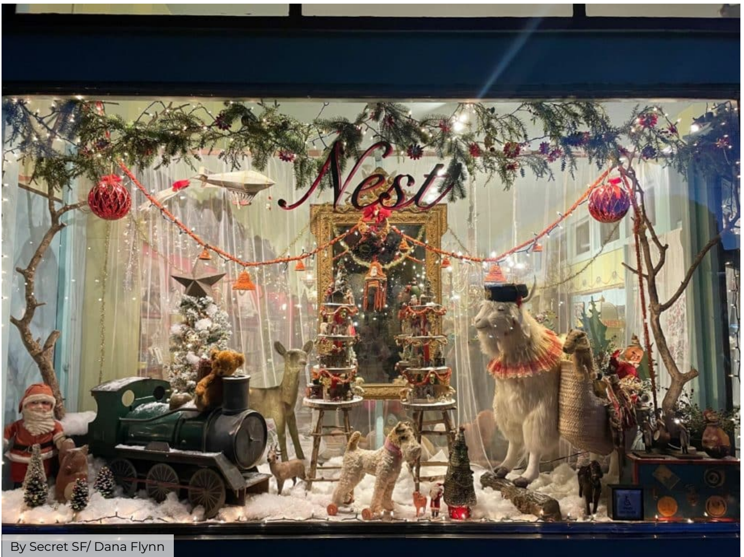
By Secret SF/ Dana Flynn

San Francisco is full of independently owned shops and boutiques where you can find the perfect items for friends, family, and a little retail therapy for yourself. Instead of heading straight to the mall, take a scroll through our lists of shopping neighborhoods and unique shops.