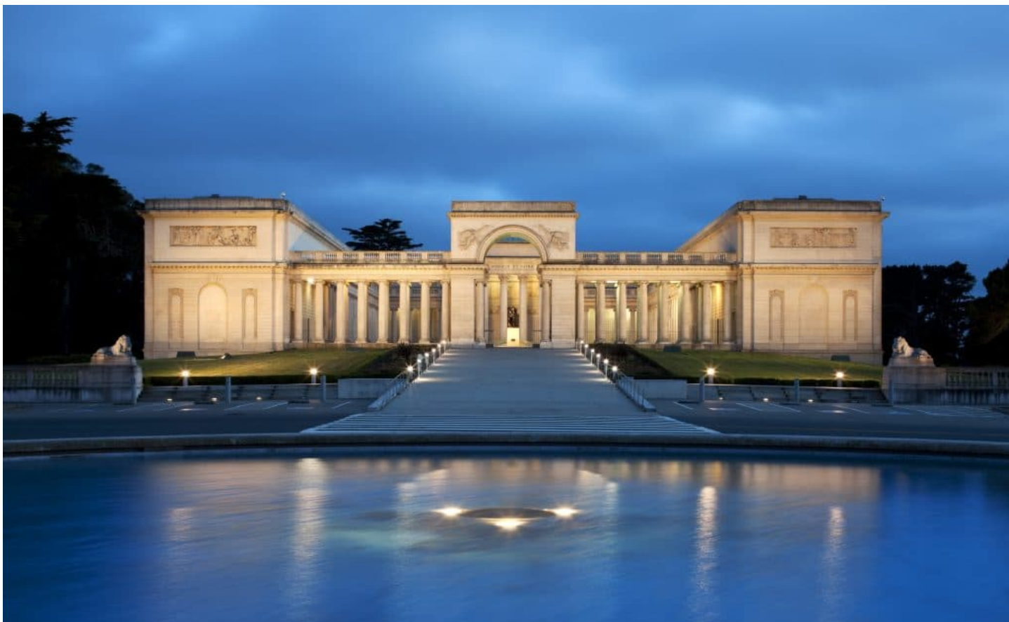
Legion of Honor in Lincoln Park.

We love San Francisco for its vibrant culture, history, and resources, but it's no secret that living here costs a pretty penny. Whether you're a college student on a budget, or a bargain hunter wanting to see the sights, this list will certainly help you get started.