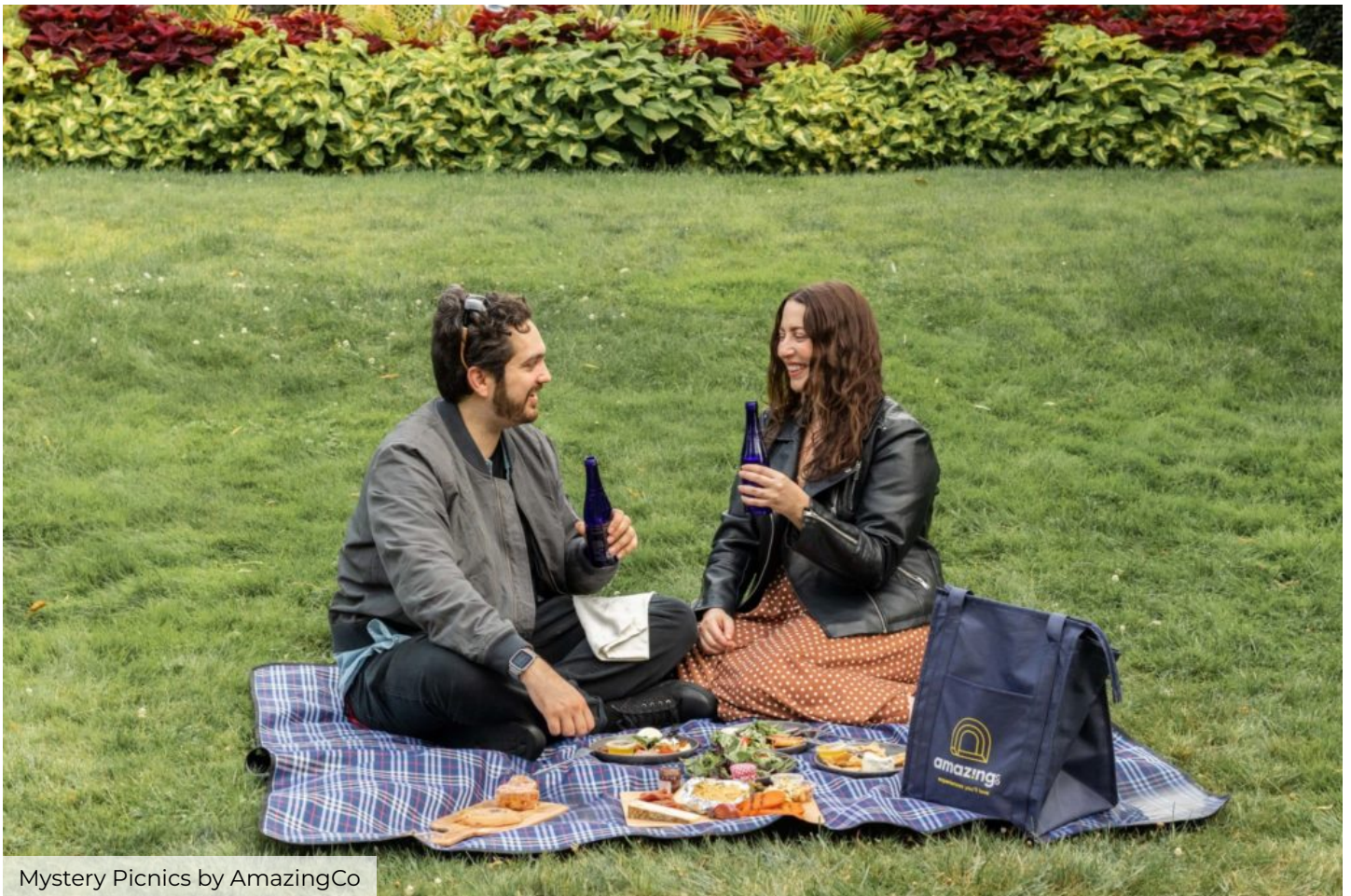
Mystery Picnics by AmazingCo

AmazingCo plans the most unique picnics where you'll solve clues, pick up artisanal treats , discover hidden neighborhood gems along the way, and finally make it to your destination for a dreamy picnic experience . Whether you're with a group of friends, your family, or a significant other, it's definitely not your ordinary picnic.