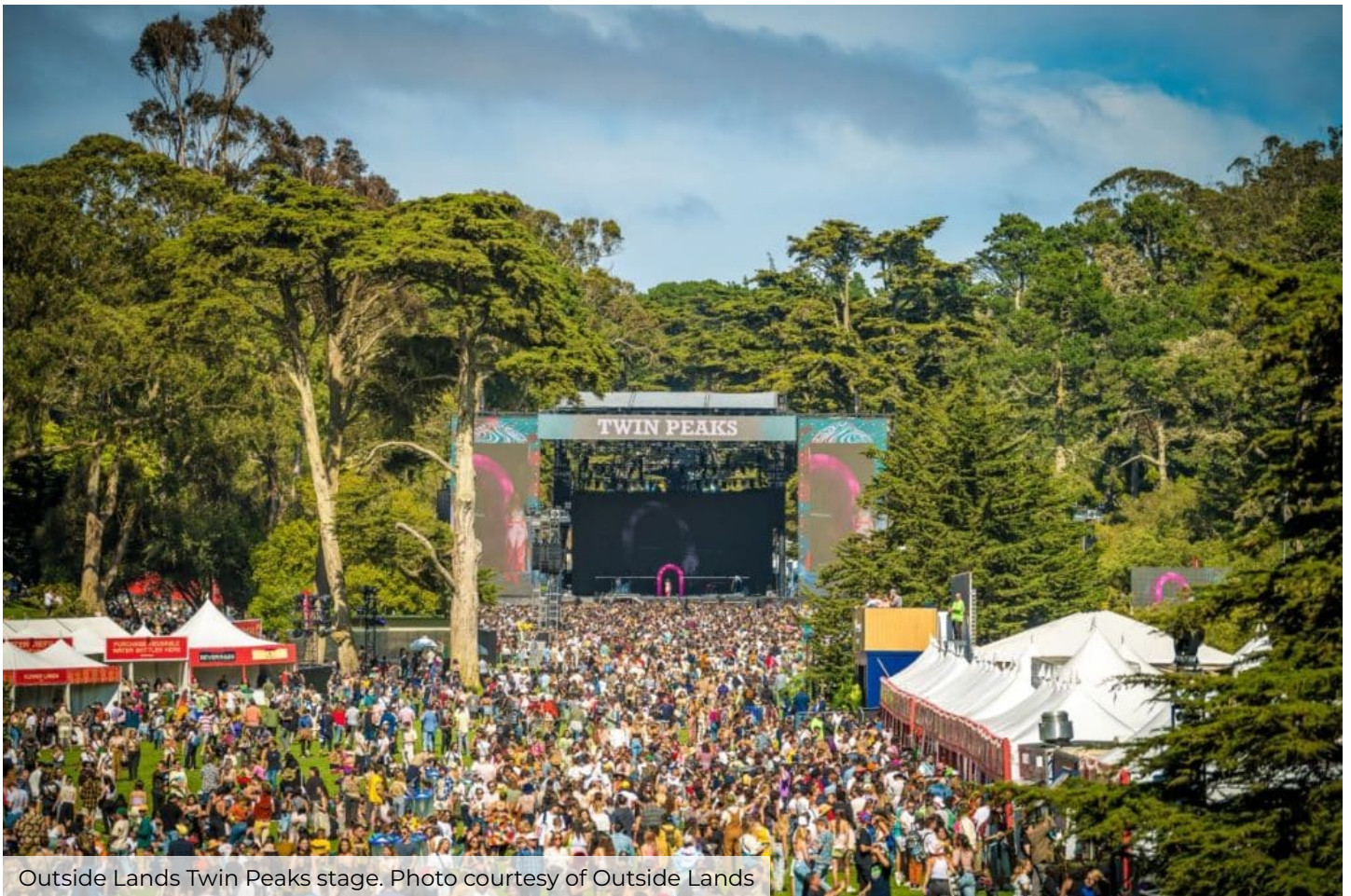
Outside Lands Twin Peaks stage.

A new year has started and we can't wait to see what it has in store for San Francisco. Here we've rounded up some of the best exhibitions, events, festivals, parades, and concerts coming up in 2024 . For events with no date yet announced, we've put the month they usually occur in so you can be on the lookout. Grab your calendar and jot down your favorites!