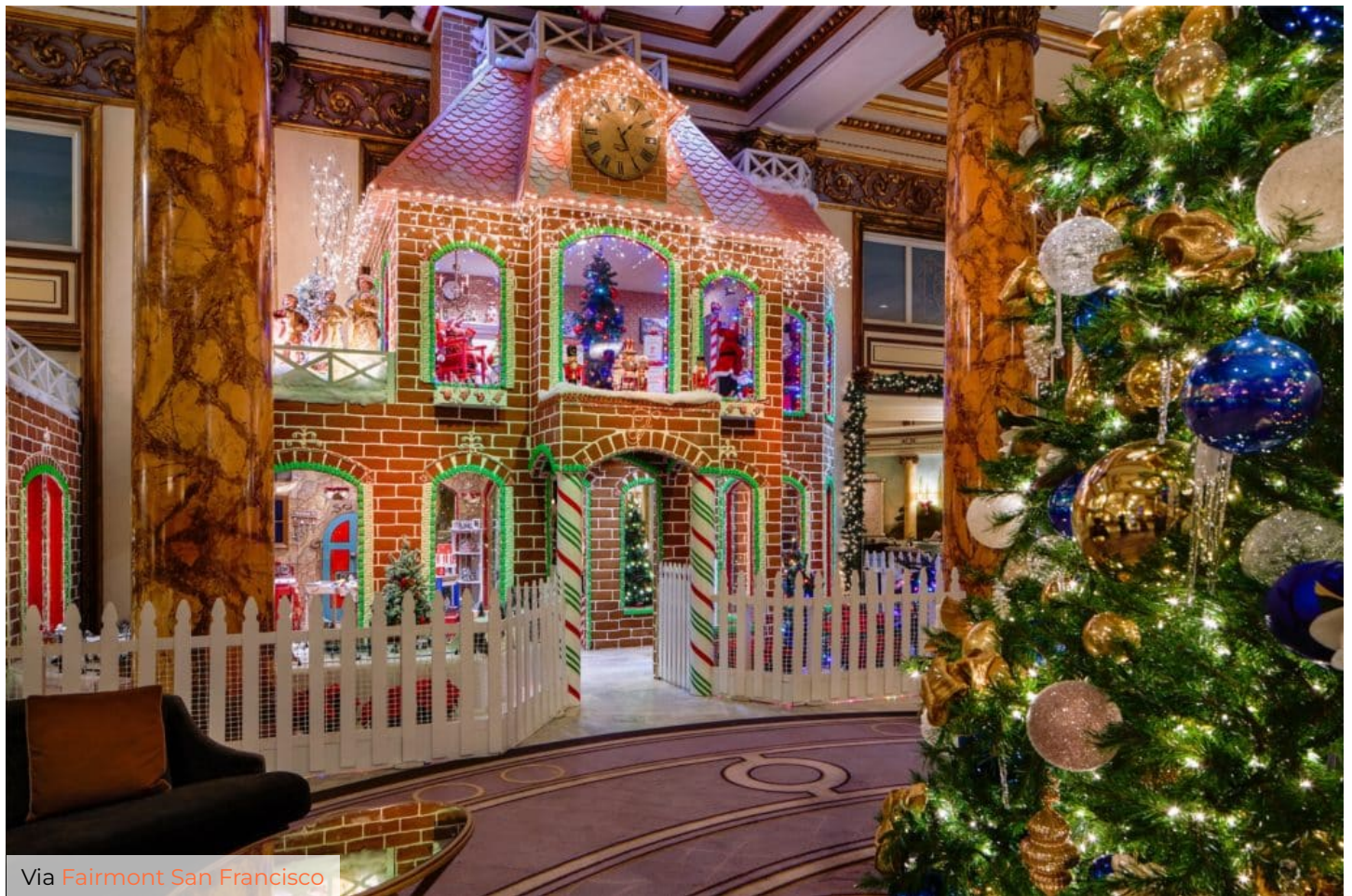
Via Fairmont San Francisco

JAMIE FERRELL - STAFF WRITER · NOVEMBER 27, 2023