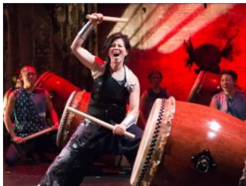
Queer Women of Color Film Festival @ Presidio Theater

The company performs Karen Zacarius' play about neighbors whose gardening and fence arguments spiral out of control. $29-$45; thru June 16, 52 West 6th St. https://6thstreetplayhouse.com ( https://6thstreetplayhouse.com )