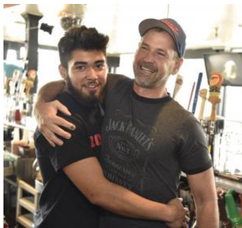
Lookout staff

Small neighborhood bar with a fireplace and an old-school jukebox. 3988 18th St. https://www.thelastcallbar.com/ ( https://www.thelastcallbar.com/ )