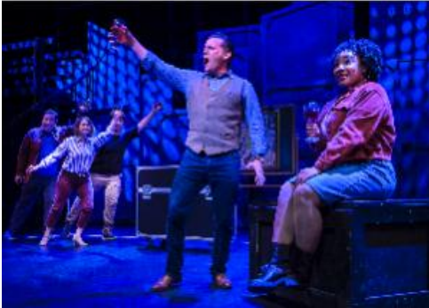
'Being Alive: A Sondheim Celebration' @ Mountain View Center for the Performing Arts

(Click here for listings of LGBTQ movies, TV series, podcasts and community organizations ( https://www.ebar.com/story.php?ch=events&sc=arts_events&id=317111 ).