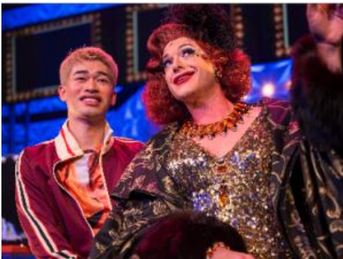
'Everybody's Talking About Jamie' @ Victoria Theatre

GLBTQ+ Asian Pacific Alliance (GAPA) and GAPA Fund, with Asian Pacific Islander Cultural Center (APICC), GAPA Men's Chorus and GAPA Theatre present a night of theater pieces and music about queer Asian lives. $20, June 15, 7pm, 450 Florida St. http://www.zspace.org/gapa ( http://www.zspace.org/gapa )