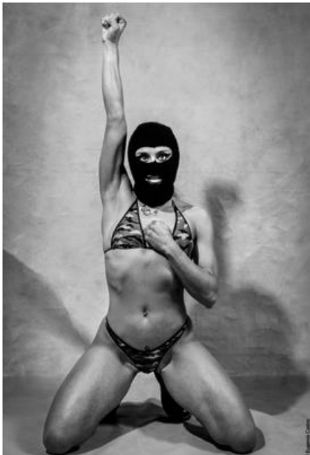
'Erotic Resistance' @ GLBT History Museum

Contemporary artists' works. 436 Jackson St. https://www.gallerywendinorris.com ( https://www.gallerywendinorris.com )