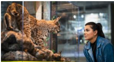
California Academy of Sciences

New art gallery exhibits works by Charles Trapolin, antiquities, and other artists. 609 Pacific Ave. https://bountysf.com/ ( https://bountysf.com/ )