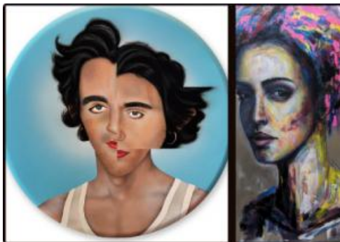
'Kindred' @ 2358 MRKT

New queer bar with a stylish retro vibe. 1548 California St. https://www.zhuzh.bar/ ( https://www.zhuzh.bar/ )