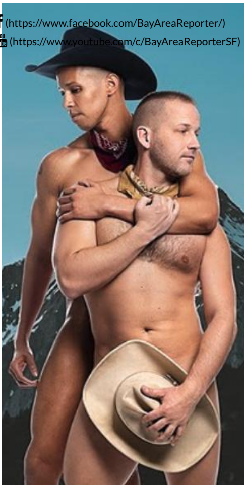
Broadway Bares SF VII @ 1015 Folsom