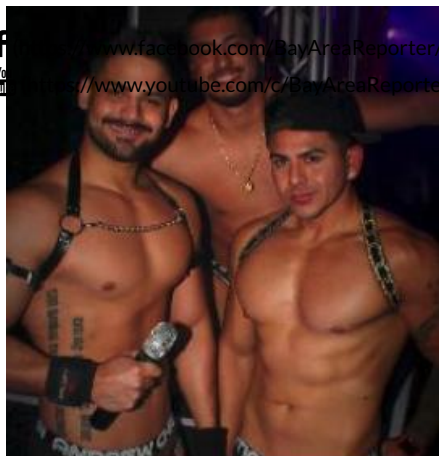
Gogo hunks @ Que Rico, Oakland