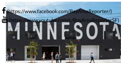
Minnesota Street Art Project

f (https://www.facebook.com/BayAreaReporter/)