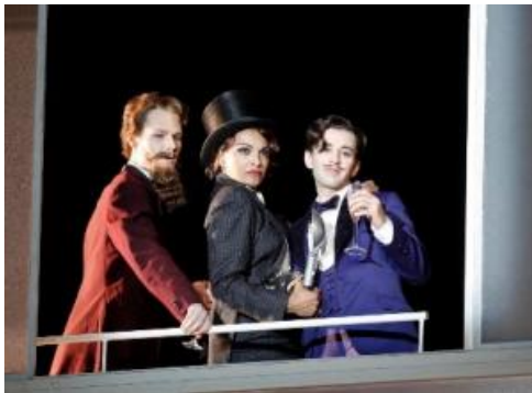
San Francisco Opera's 'Partenope' @ War Memorial Opera House

https://www.ebar.com/story.php?ch=arts_culture&sc=music&id=333391 .)