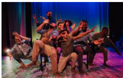
'I, Too, Sing America' @ Grace Cathedral

Berkeley Playhouse performs the 18th-century-set musical comedy with songs by The Go-Go's. $27-$52, thru June 30. 2640 College Ave. www.berkeleyplayhouse.org ( https://tickets.berkeleyplayhouse.org/Online/default.asp )