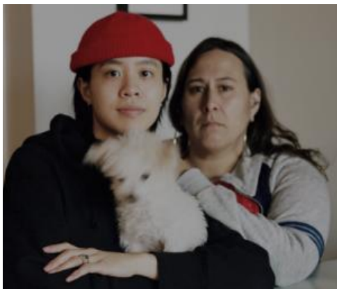
'Just Another June' @ Root Division

Contemporary art exhibits. 49 Geary St. https://kochgallery.com/ ( https://kochgallery.com/ )