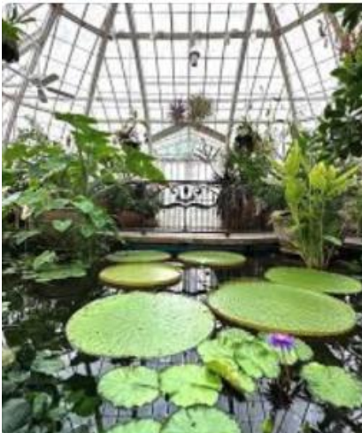
Conservatory of Flowers

Programs include live science programs each Wed., 10:30am, virtual telescope viewings each Sat. 9pm. Free/$15. 1000 Skyline Blvd, Oakland. chabotspace.org ( http://chabotspace.org )