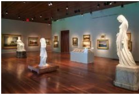
de Young Museum

Home converted into an intimate gallery of unusual art projects by the late artist and designer and other invited artists. 500 Capp St. https://500cappstreet.org/ ( https://500cappstreet.org/ ) (Read our article ( https://www.ebar.com/story.php?ch=arts_culture&sc=theater&id=323219 ).