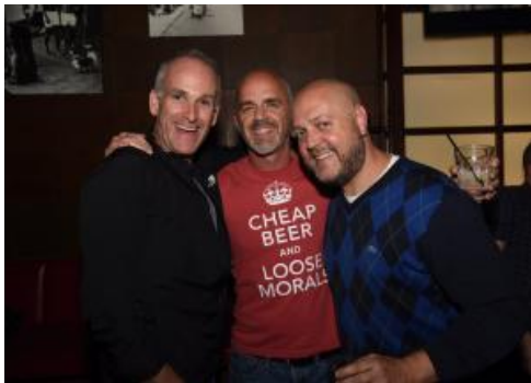
Midnight Sun