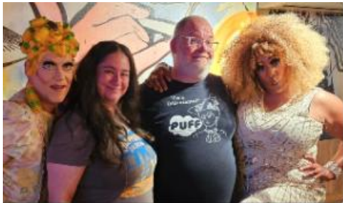
Bong-O Bingo @ Mission Cannabis Club