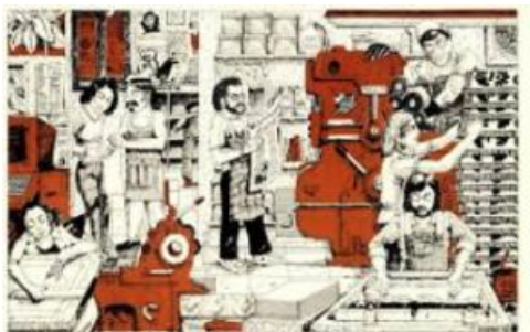
'A Public Voice/Una Voz Pública' @ SF Arts Commission Gallery

New Castro/Duboce gay-owned art gallery. Cobi Moules' 'Showering of Sparkling Bits,' thru June 22. 2128 Market St. Tue-Sat 12pm to 6pm and by appointment. https://schlomerhaus.com/ ( https://schlomerhaus.com/ )