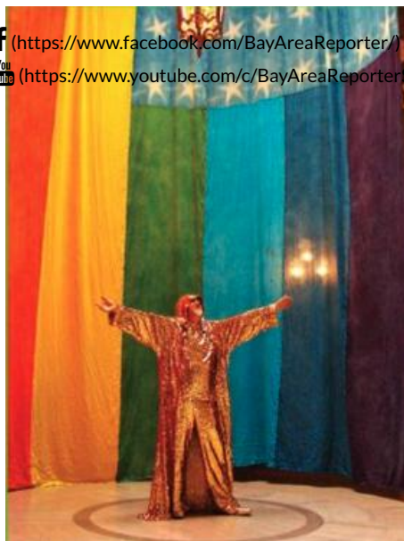
'Living Life Golden' @ Harvey Milk Photo Center