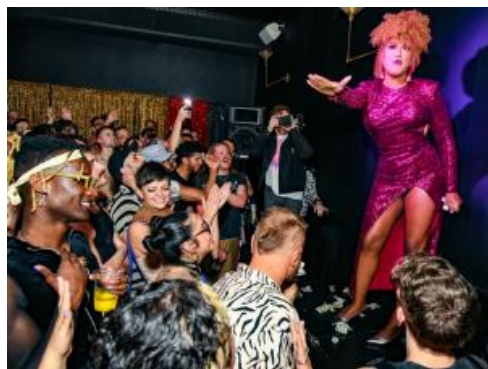
The Stud

The award-winning bathhouse hosts special events, DJed nights, and a cruisy vibe. $5-$200 (6-month membership). 18+ only. Open 24/7 every day. 2107 4th St., Berkeley. https://www.steamworksbaths.com/berkeleyhome ( https://www.steamworksbaths.com/berkeleyhome )