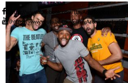
Hi Tops