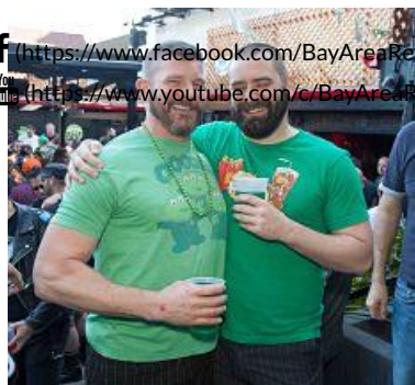
SF Eagle beer bust