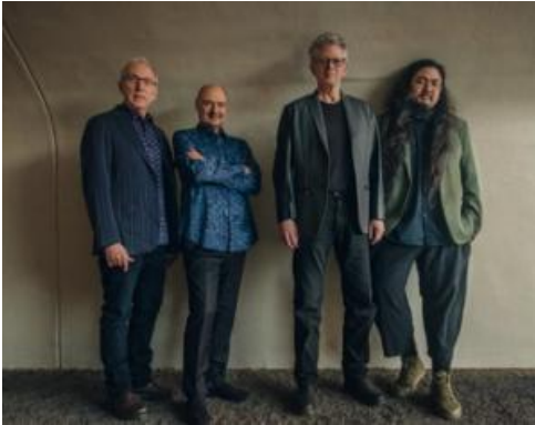
Kronos Quartet Festival @ SF Jazz

http://www.sfsymphony.org/ ( http://www.sfsymphony.org/ )