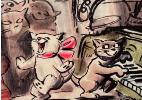
'Disney Cats & Dogs' @ Walt Disney Family Museum

New and permanent exhibits of neighborhood history. 'Central City 1970-2016' by Dave Glass in the Tenderloin Museum's art gallery space. A prolific San Francisco street photographer, Glass documented the Tenderloin's denizens; thru Dec. 30. 398 Eddy St. http://www.tenderloinmuseum.org/ ( http://www.tenderloinmuseum.org/ )