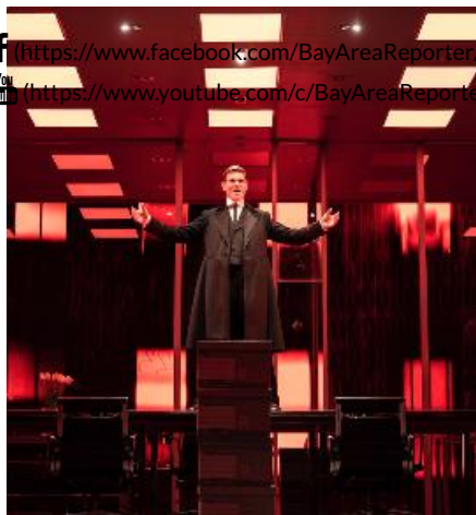
'The Lehman Trilogy' @ Toni Rembe Theatre