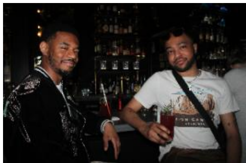
Town Bar & Lounge, Oakland

Spacious Castro bar with a small dance floor and back patio. 4146 18th St.