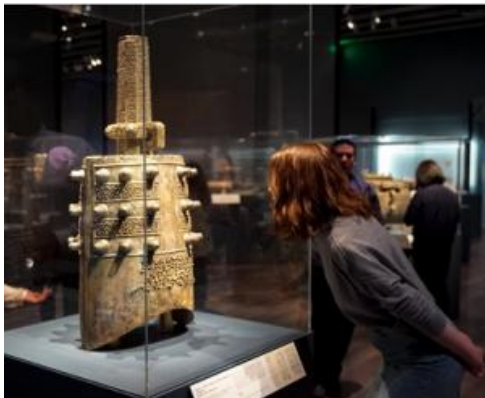
'Phoenix Kingdoms: The Last Splendor of China's Bronze Age' @ Asian Art Museum

( https://gershoni.com/culture/dyslexic-dictionary )