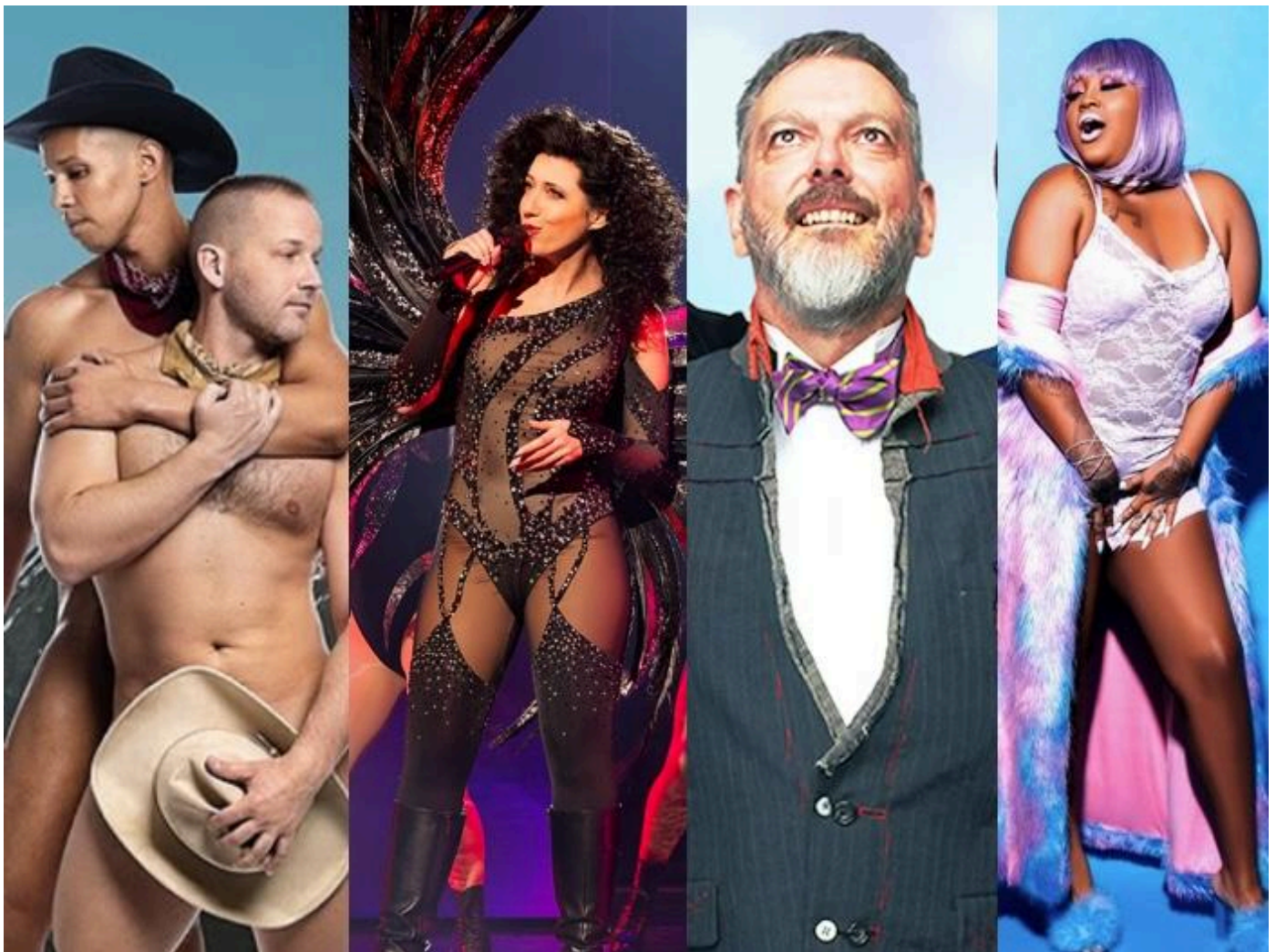
Broadway Bares SF VII @ 1015 Folsom; 'The Cher Show' @ Curran Theater; San Francisco Gay Men's Chorus @ Davies Symphony Hall; CupcakKe @ 1015 Folsom