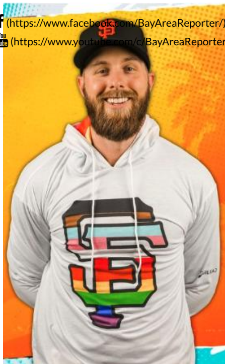
Pride Day @ Oracle Park