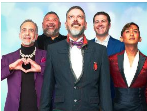
San Francisco Gay Men's Chorus @ Davies Symphony Hall

Frequent concerts of classical and contemporary music by students, faculty and visiting artists, most free. 50 Oak St. https://sfc.edu/ ( https://sfc.edu/ )