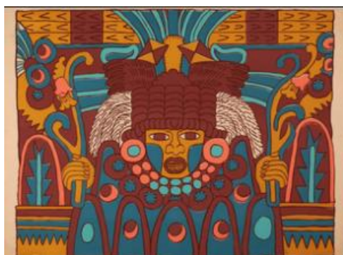
'Calli: The Art of Xicanx People' @ Oakland Museum

Exhibits include contemporary works by African and Black artists, and about Black culture; also, award-winning films, talks and music performances. 'Unruly Navigations,' 22 works by 10 artists in various media, and Rachel Jones' '!!!!!!,' abstract figurative paintings of teeth and mouths that represent Black interiority; both thru Sept. 1. Free-$12. 685 Mission St. www.moadsf.org ( https://www.moadsf.org/ )