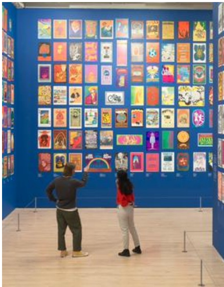
'Art of Noise' @ SF Museum of Modern Art