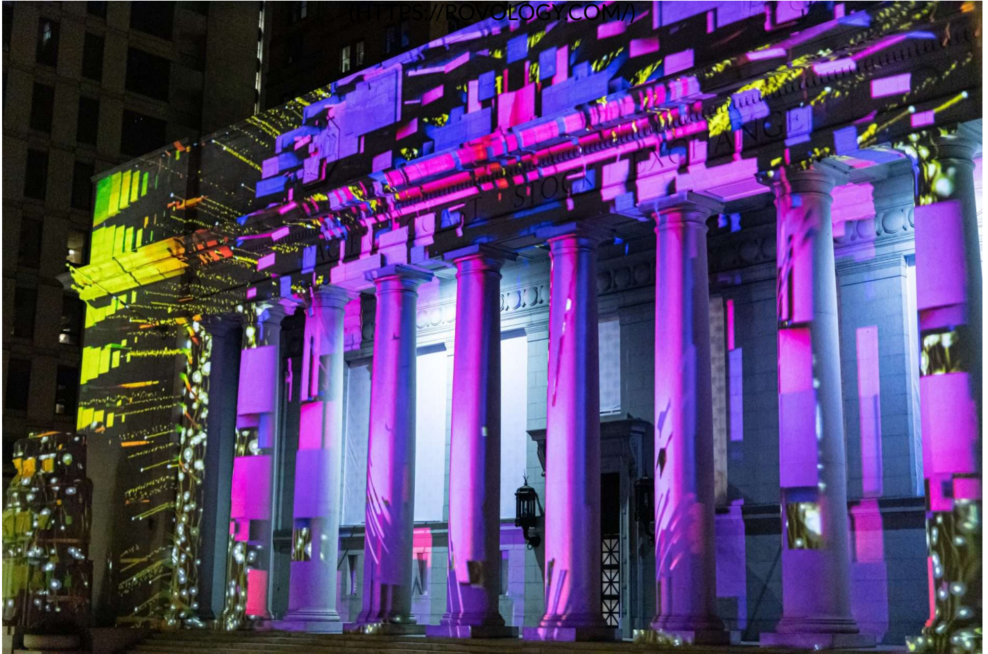
301 Pine Street lit up for Let's Glow SF 2023.