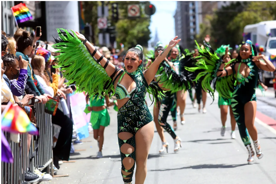
SAN FRANCISCO, CA – JUNE 26: Dancers perform along Market Street during the 52nd annual San Francisco Lesbian Gay Bisexual Transgender Pride Parade on Sunday, June 26, 2022, in San Francisco, Calif.

Castro Family Pride Block Party: 11 a.m. to 5 p.m. June 24, Noe Street between Market and Beaver streets, San Francisco. The second annual Castro Family Pride Block Party will feature a petting zoo, a costume contest, kids activities, drag performances, storytime and other fabulous festivities. Free admission. CastroFamilyPride