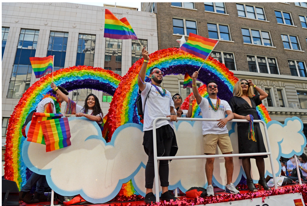
Parade participants atop the Wells Fargo float wave to the crowds during the Oakland Pride parade in Oakland, Calif., on Sunday, Sept. 9, 2018.

Here's a sampling of all the Pride parties, parades, and festivals to check out in the Bay