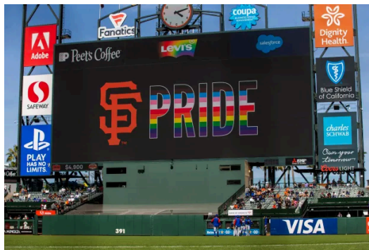
SAN FRANCISCO, CA – June 5: The San Francisco Giants celebrate Pride, Saturday, June 5, 2021, during their game with the Chicago Cubs in San Francisco, Calif.

JCC Pride Family Festival: 3 to 5 p.m. June 15, Jewish Community Center of San Francisco, 3200 California St., San Francisco. The Jewish Community Center of San Francisco is hosting a family-friendly Pride celebration featuring crafts, stories, dancing, social action, an indoor parade and a drag show. Free admission. jccsf.org/event/pride-family-festival/