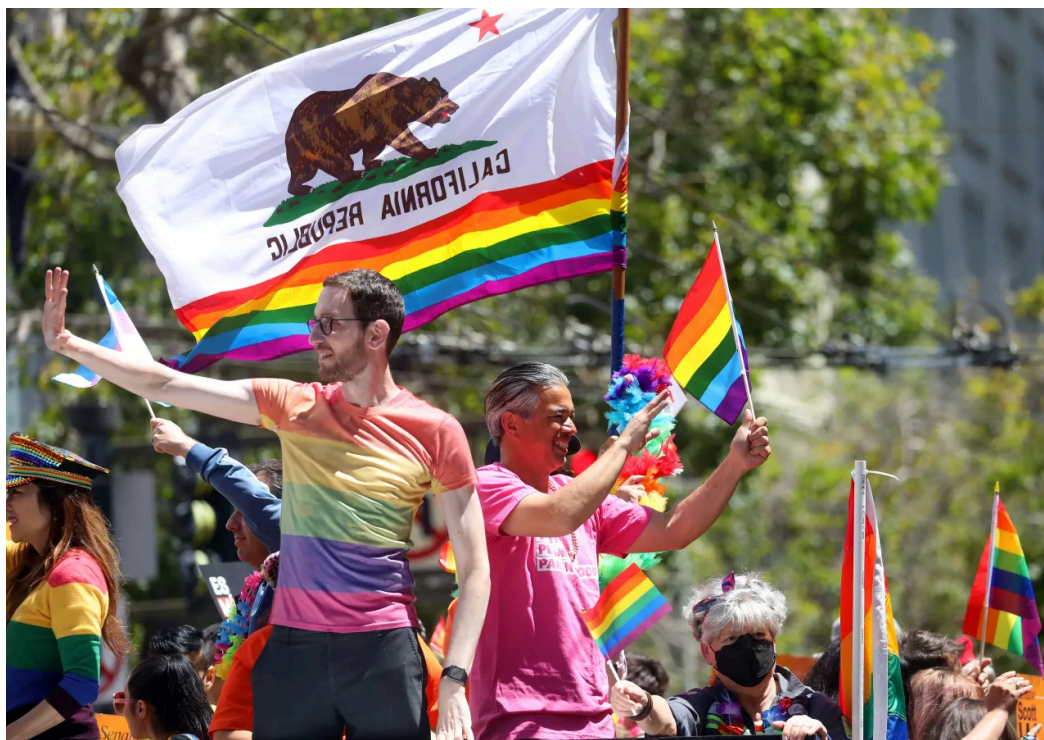
SAN FRANCISCO, CA – JUNE 26: State Senate member Scott Wiener, left, and attorney general of California Rob Bonta, center, ride atop a float during the 52nd annual San Francisco Lesbian Gay Bisexual Transgender Pride Parade on Sunday, June 26, 2022, in San Francisco, Calif.

Pride at Bay Area Discovery Museum: 10 a.m. to 4 p.m. June 29, Bay Area Discovery Museum, 557 McReynolds Road, Sausalito. The exciting Pride celebration programming will include Rainbow Wing craft-making, Proud to Be Me self-portrait collage curation, Drag Storytime, Love Print foam fun, plus a Pride parade and giveaway. $2 to $20. tinyurl.com/BADMpride