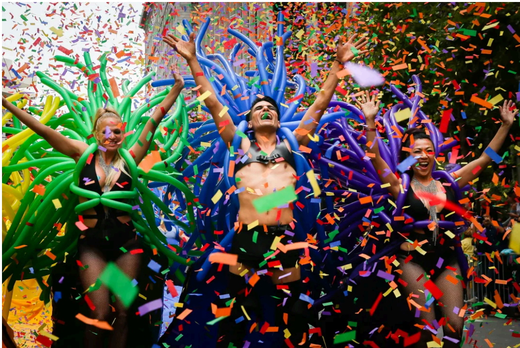
People dance in the annual LGBTQI Pride Parade on June 25, 2017 in San Francisco, California. The LGBT community descended on Market Street for the 47th annual Pride Parade

Here's a sampling of all the upcoming Pride parties, parades, and festivals to check out in the Bay