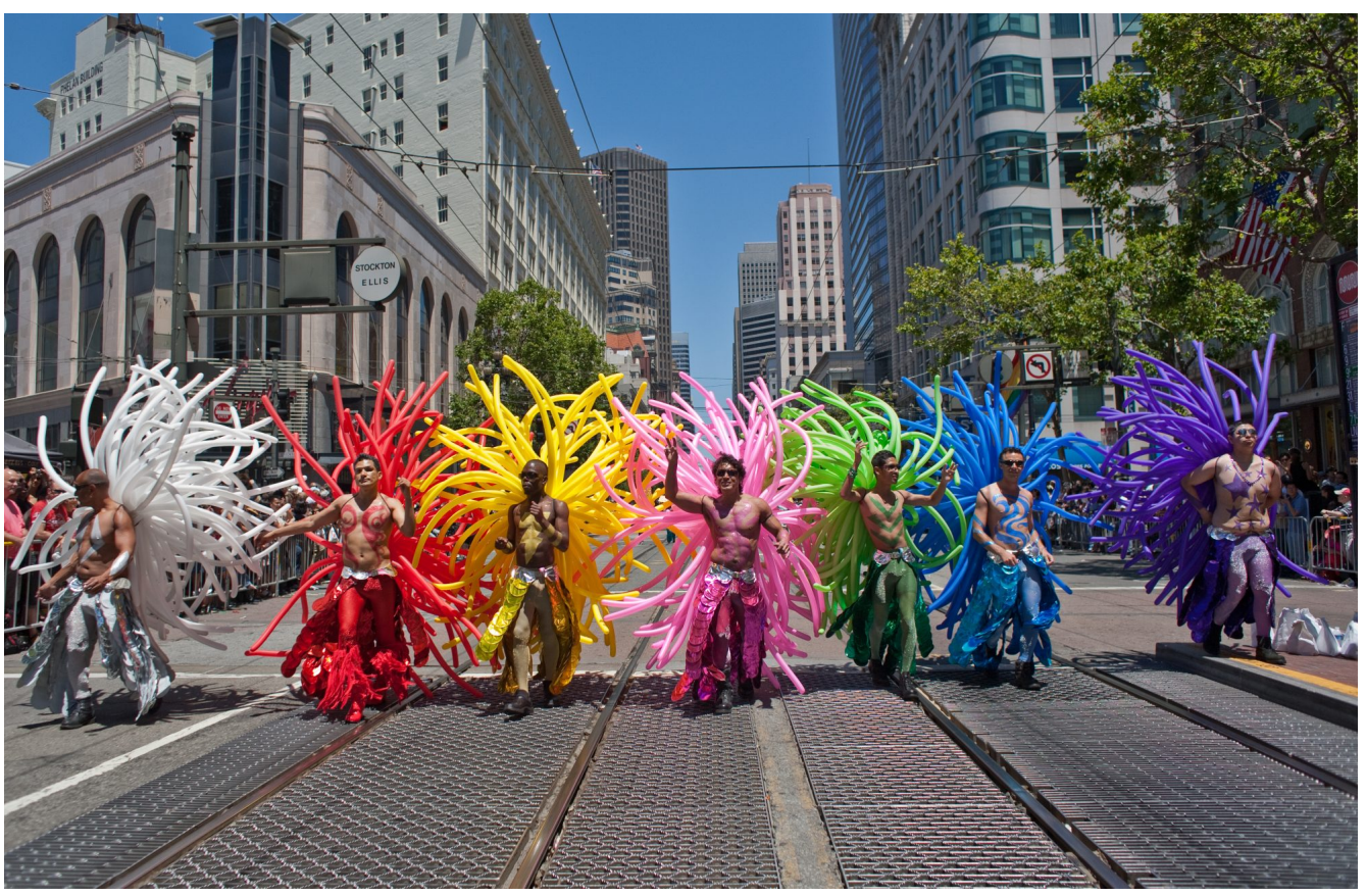
Oth Annual San Francisco Gay Pride Parade where the theme was "Forty and Fabulous" in San Francisco, Calif. on Sunday June 27, 2010.

ibrant 49 square miles, everyone is invited to revel in the spirit of Pride. As the city decks itself out in multi-coloured hues, immerse yourself in a celeb ality, and self-expression. From the iconic parade down Market Street to the lively festivities at Pride Central, there is something for everyone to enjoy is together to honour this shared journey towards equality and celebrate the diversity of San Francisco's LGBTQ+ community.