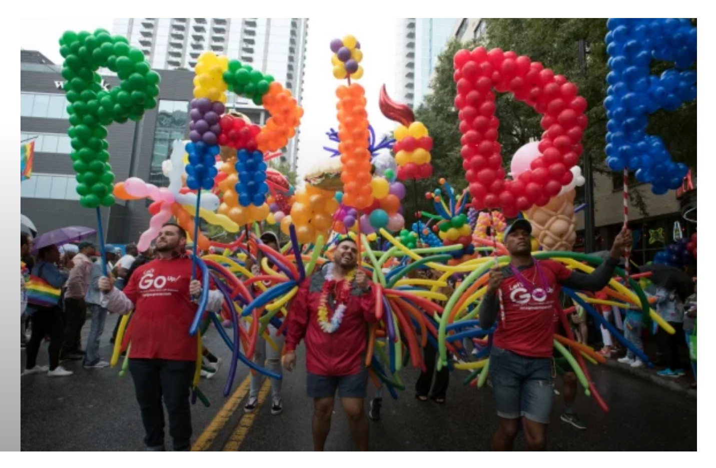
our Guide To LGBTQ+ Friendly Neighborhoods In Atlanta, Georgia