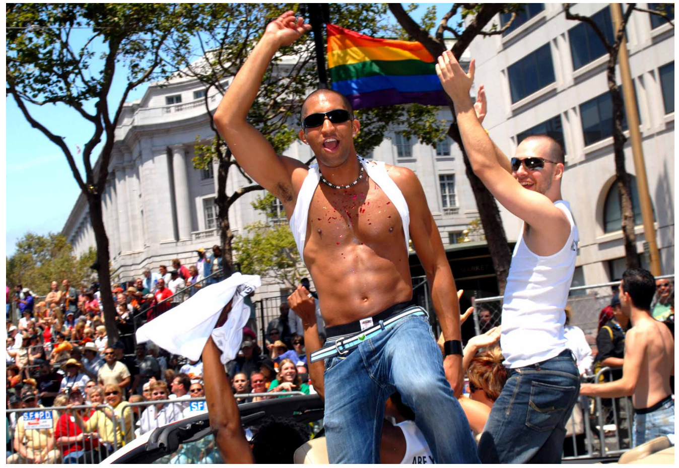
Parade in San Francisco, CA.