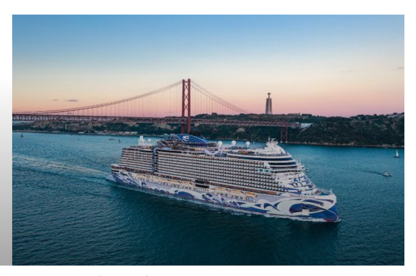
nis New Cruise From Rome To Lisbon Is A Mediterranean treat