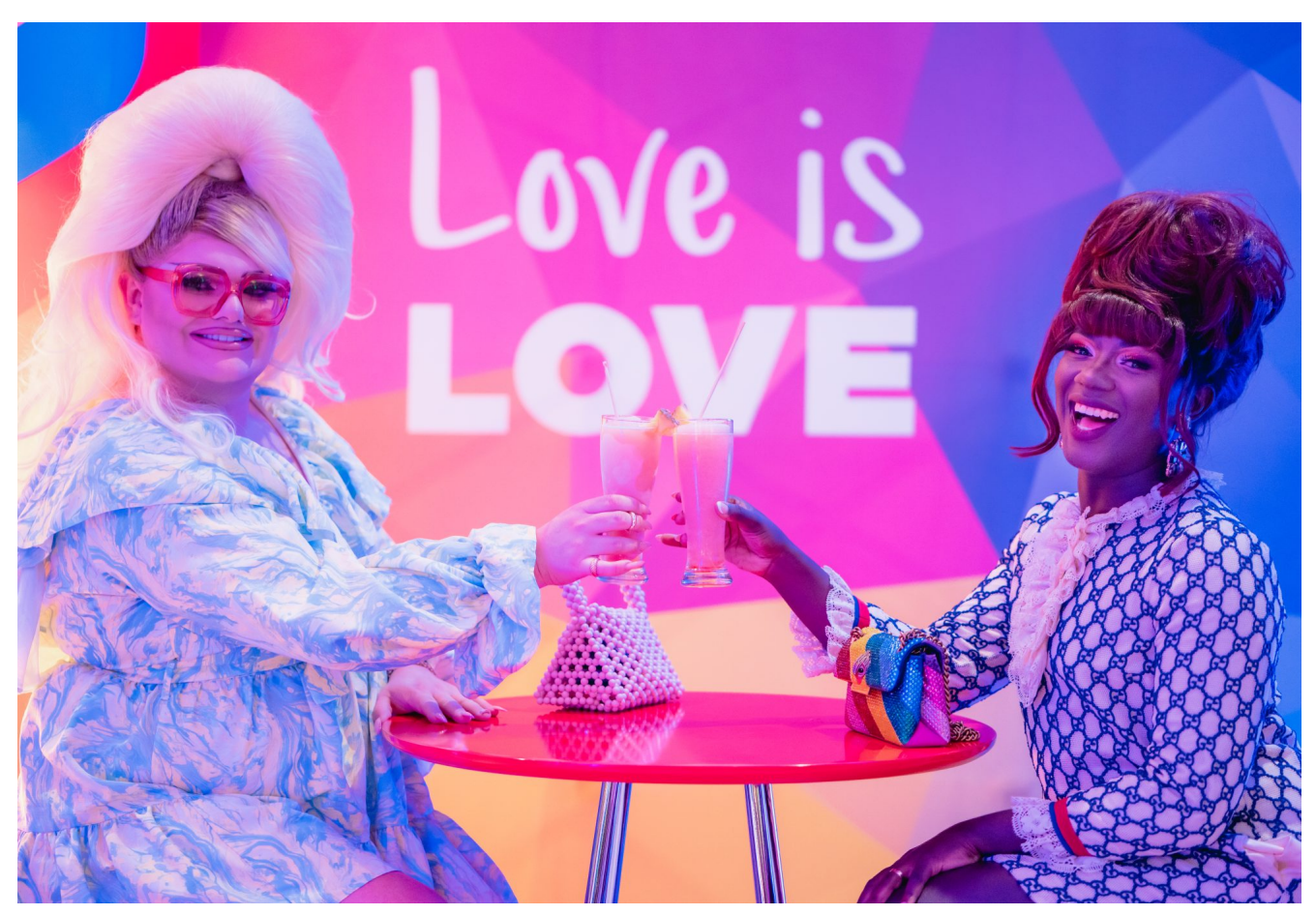
o