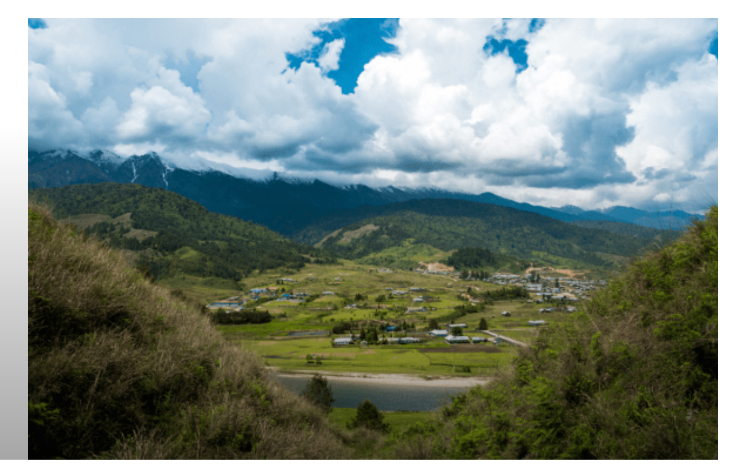
ne Road Less Travelled | A Journey Through Arunachal Pradesh's Hidden Gems