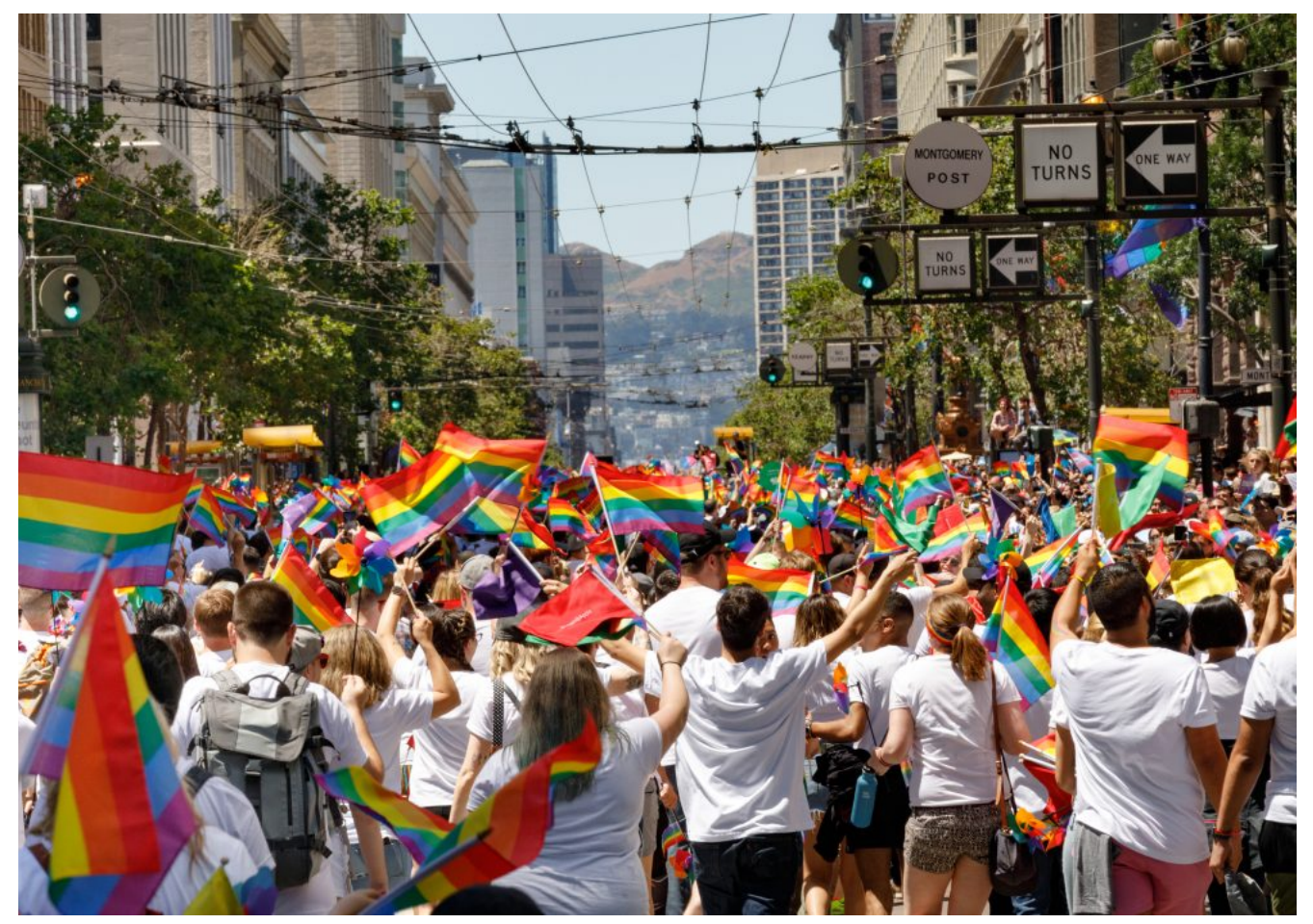
Parade in San Francisco, CA on June 24, 2018.