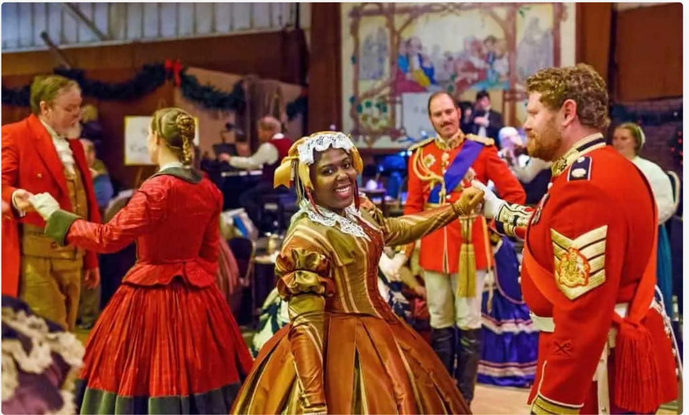
The Great Dickens Christmas Faire

One of the greatest ways to celebrate Christmas in San Francisco could also be classified as a time travel portal. You will swear you've been transported to Victorian London when the Great Dickens Christmas Fair takes over the San Francisco Cow Palace .