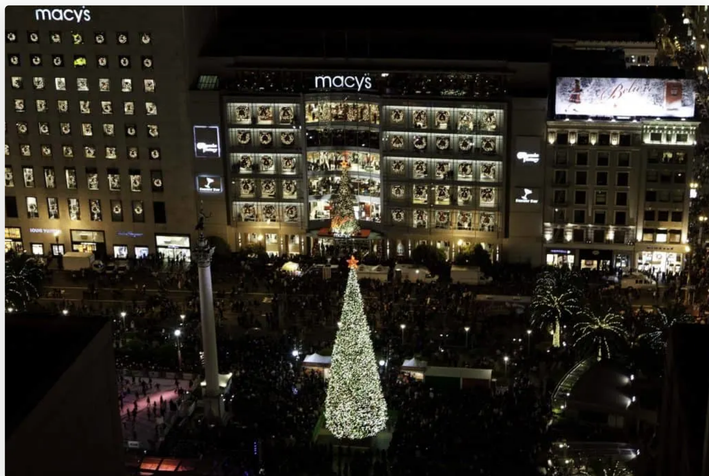
Union Square, Photo by Drew Altizer/ San Francisco Travel