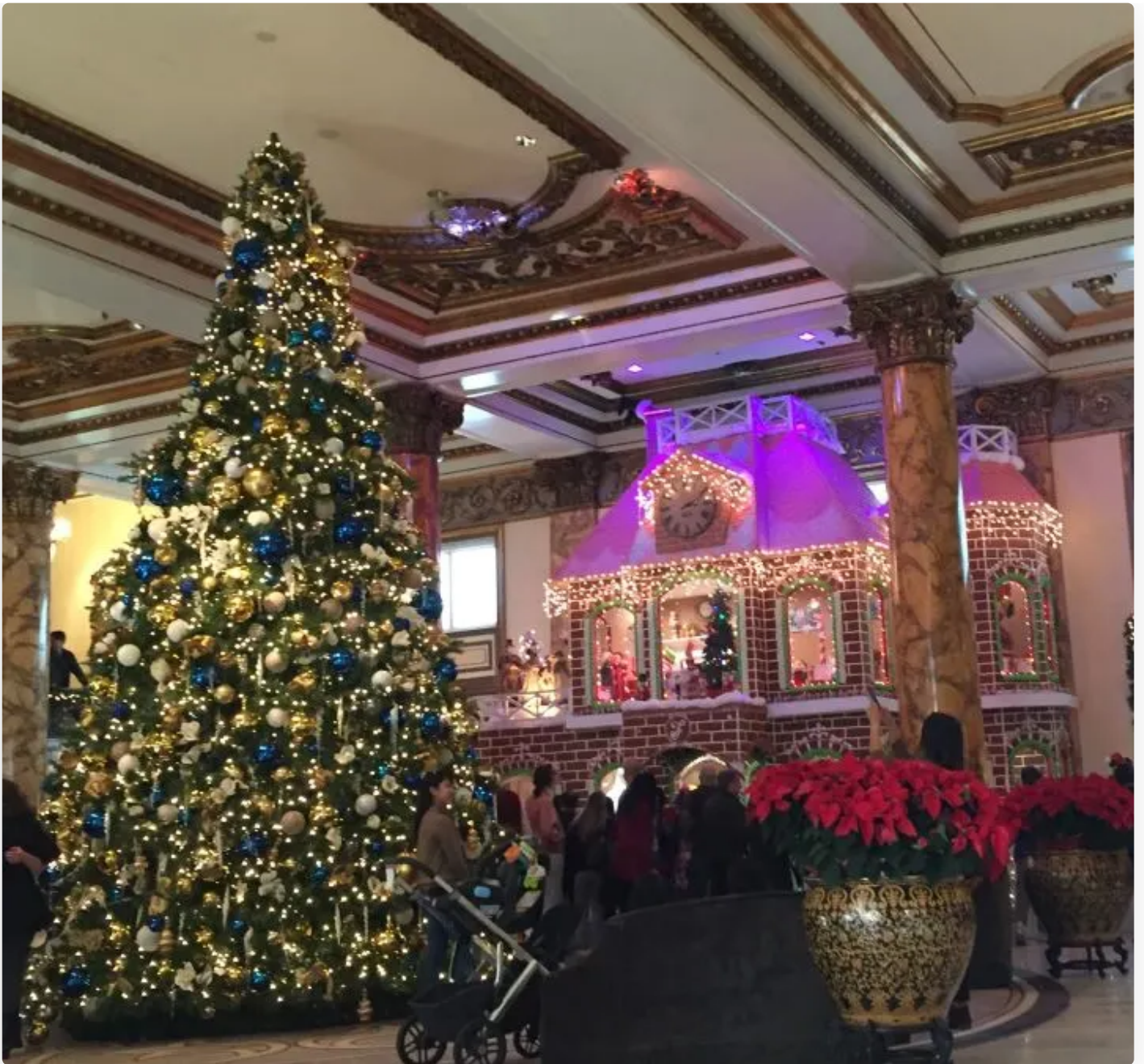
The Fairmont's Grand Lobby is all ready for Christmas

Christmas in San Francisco has included the time-honored tradition of afternoon tea at the Fairmont Hotel since the establishment opened in 1907. The hotel offers afternoon tea service in the same style it was served 100 years ago. Make your reservations soon! Holiday teas are offered from November 24 – December 31, 2023.