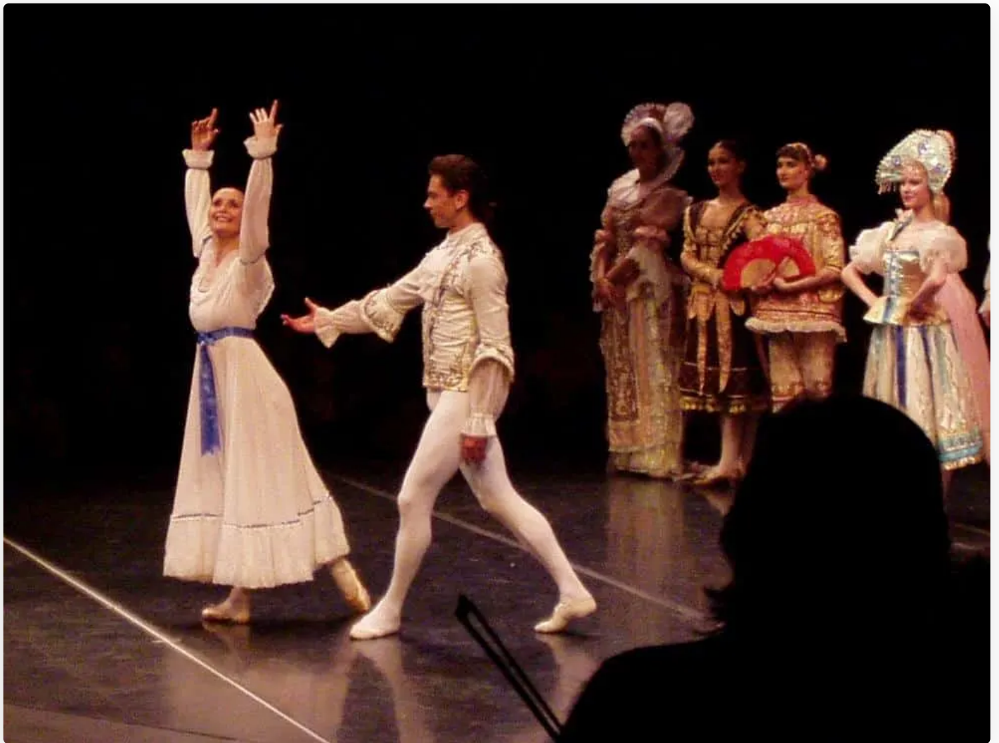
The San Francisco Ballet Nutcracker