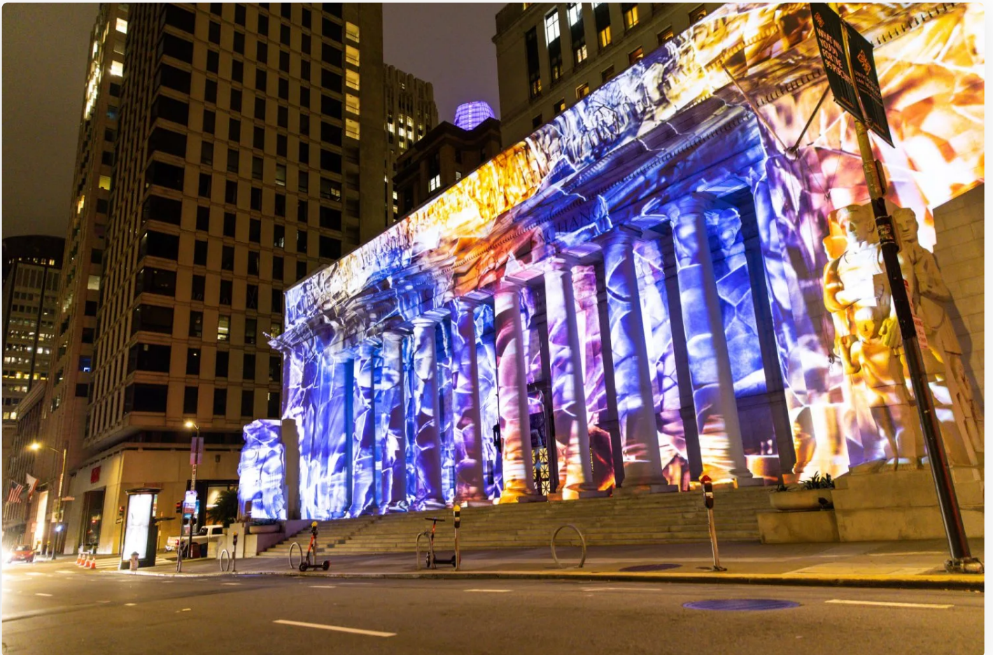
Let's Glow at the Pacific Stock Exchange

Four buildings in the Financial District have light displays on them nightly from December 1 -10, 2023. Let's Glow SF shines on the Pacific