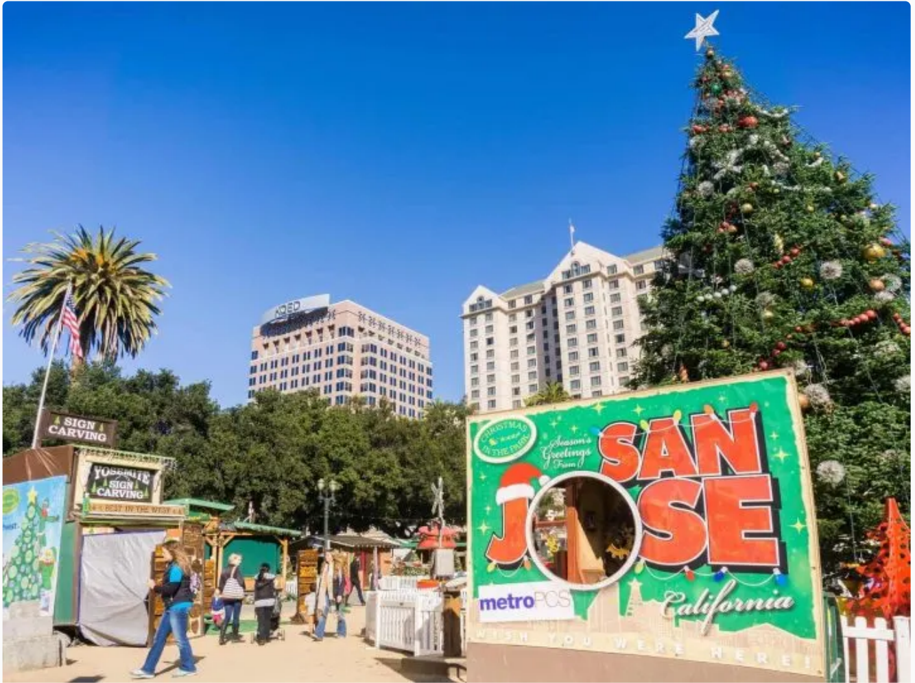
← San Jose Christmas Events – Christmas in the Park & More!