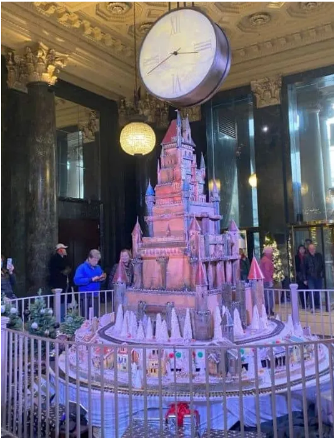
The Sugar Castle

Stop by the Landmark Lobby at the Westin St. Francis to check out the Sugar Castle! It simply wouldn't be Christmas in San Francisco without this sweet tradition! A one-of-a-kind rotating 12-foot-tall winter wonderland features brilliantly colored ornaments, elaborate gift boxes, candies, and Christmas trees, the Sugar Castle weighs over 1200