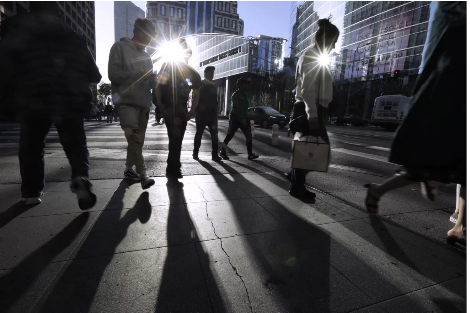
Pedestrians make their way through downtown Los Angeles on April 10.

One recent Tuesday morning, office workers dodged puddles and hid under umbrellas, stopping to pick up almond lattes and scones at Nice Coffee, an open air cafe in City National Plaza. Rain lashed the plaza's skyscrapers, their neat rows of office windows stacked one atop the other, revealing mostly empty rooms under glaring white lights.