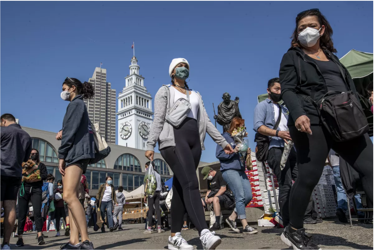
San Francisco's Embarcadero saw a return of locals and tourists to the Farmer's Market in October 2021.

It's not just remote work that's hamstringing recovery. Public safety is a top concern, though data indicate violent crime has fallen over the last decade and is below that of cities of similar size. The fentanyl crisis has hit the city especially hard, prompting Gov. Gavin Newsom to call in the California National Guard and the California Highway Patrol to help San Francisco police and prosecutors target traffickers.