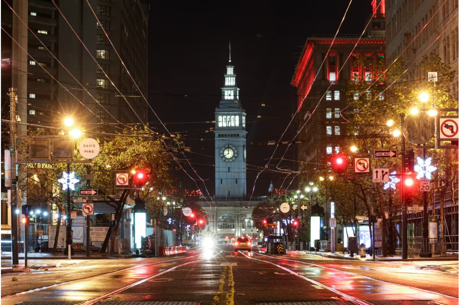
A night view of the Ferry Building and Market Street in San Francisco.