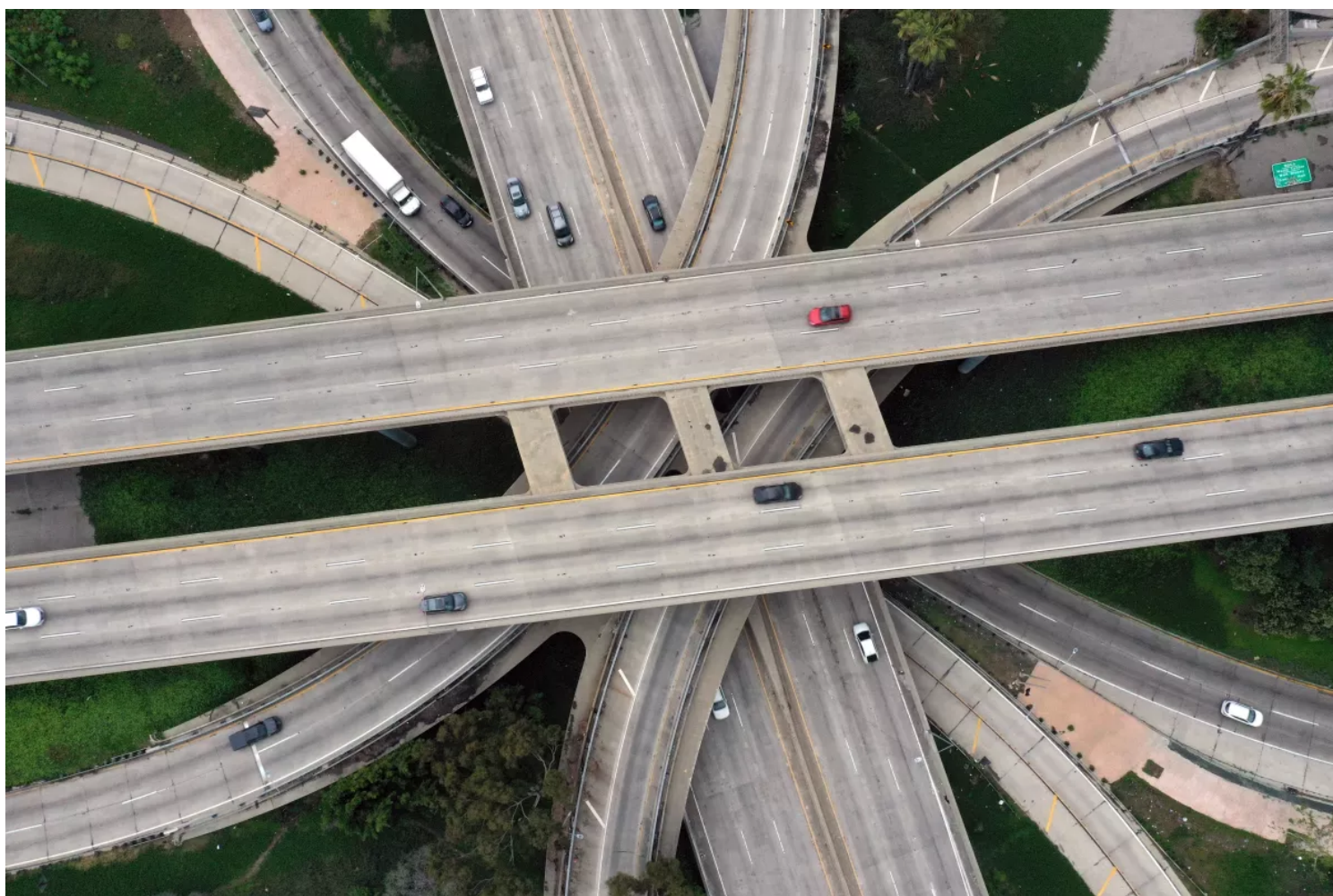
During the pandemic lockdown in May 2020, the 101 and 110 freeways were virtually empty.