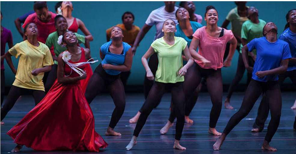
Students from a previous AileyCamp youth dance program perform in Zellerbach Hall.

7 p.m. Thursday, July 27. Free, reservations required. Zellerbach Hall, Bancroft Way at Dana St., UC Berkeley. 510-642-4630. calperformances.org/aileycamp .