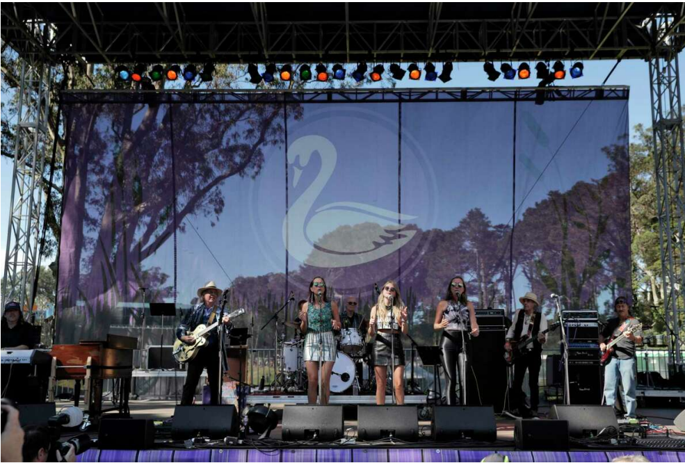
Moonalice performs on the Swan Stage with the Tietjen Sisters during the Hardly Strictly Bluegrass Festival 2019 at Golden Gate Park in San Francisco.