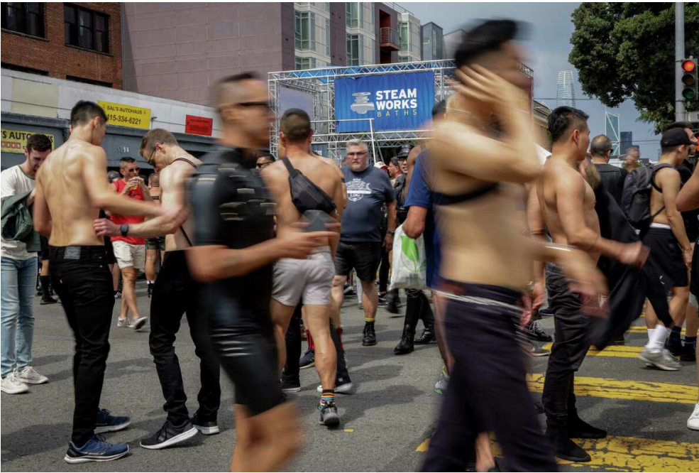
Visitors walk by the main stage at the annual Up Your Alley leather and fetish fair in San Francisco in 2022.