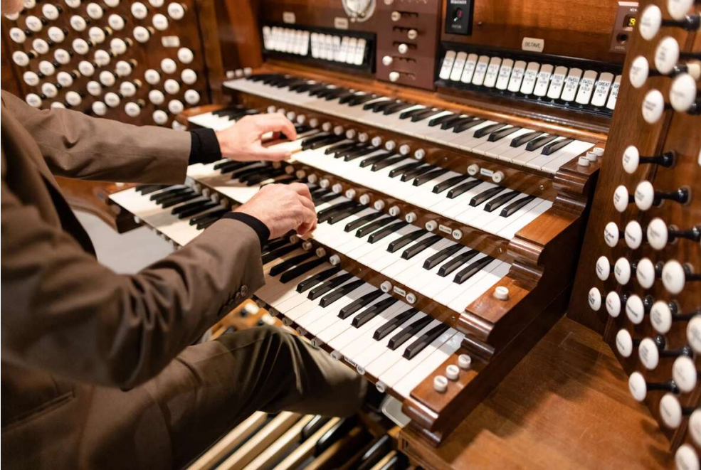
View fine art as you listen to a live performance on the historic Spreckels organ at the Legion of Honor.

6-9 p.m. Friday, July 14; 3-9 p.m. Saturday, July 15. Free admission; beer tasting tickets are $65-$85 . 147 Gregory Lane, Pleasant Hill. bluesandbrewsfestival.com