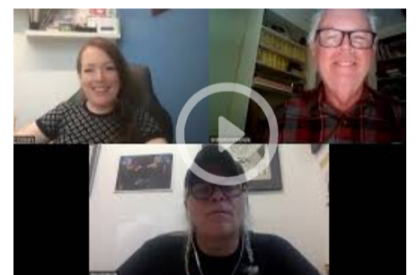
Celtic Colours Festival