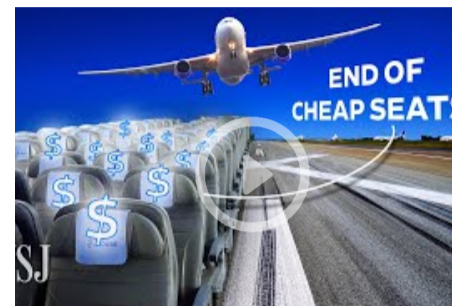
Airlines Are Offering Ultra-Cheap Transatlantic Flights, But How Long Can They Last? | WSJ