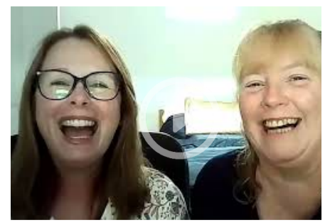
Did you watch Race Across the World? Meet the winners and meet Nova Scotia

RARE WORKS: Reuniting rare works from across the US and Europe, Botticelli Drawings — presented exclusively at the Fine Arts Museums of San Francisco's Legion of Honor from November 19 to February 11 — is the first exhibition to explore the central role that drawing played in Botticelli's art and workshop practice. The exhibition unveils five newly attributed drawings alongside more than 60 works from 39 lending institutions. Botticelli Drawings features 27 drawings by the artist.