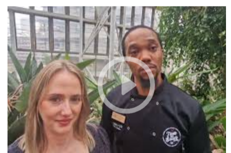
We talk South Carolina food - We talk South Carolina delicious