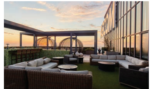
Reimagining DTLA's office towers: WeWork at Gas Company Tower (top) and One California Plaza.

As part of the DTLA: Make It Yours campaign, the DCBID launched a Hacking the Highrise marketing initiative to highlight how DTLA's office towers are being reimagined for a new generation of tenants and a new era of city living in DTLA. We're focusing on innovative office spaces, common areas, infrastructure, technology, amenities, social activity, and cultural programming that connect people and companies within their buildings and to the surrounding neighborhoods. The initiative kicked off with a launch event in