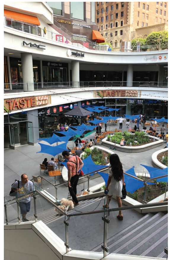
FIGat7th is a prime example of thriving retail in DTLA.

Download the 2018 Retail Report at DowntownLA.com/2018retail