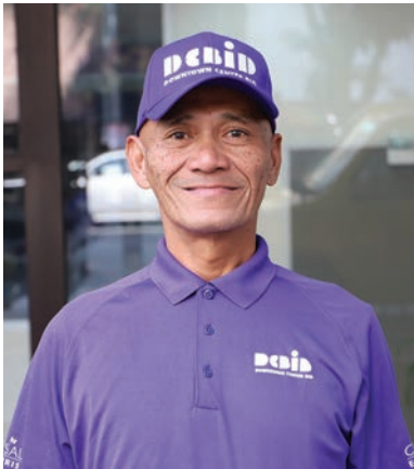
Tomas Claudio Maintenance Team