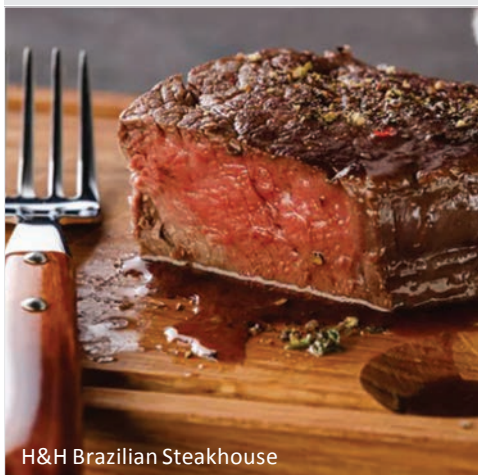
H&H Brazilian Steakhouse