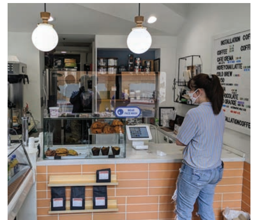
Social distancing at Installation Coffee

We connected with local business owners at our monthly DTLA Marketing Roundtable meetings, which have gone