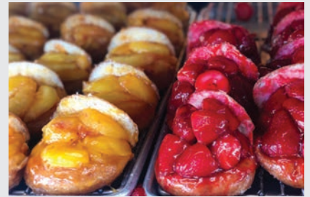
The Donut Man

317 S. Broadway (Grand Central Market) thedonutmanca.com