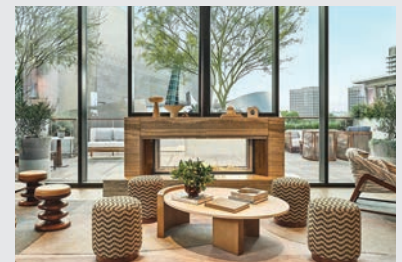
Conrad Los Angeles 100 S Grand Ave thegrandla.com