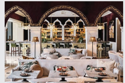
Hotel Per La 649 S Olive St hotelperla.com