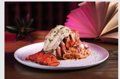
La Conde 800 W 6th St laconderestaurants.com