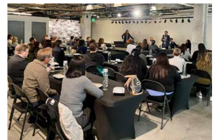
A recent Safety Meeting

Our long-standing Marketing Roundtable meetings were given an exciting revamp this quarter with updates like special rotating meeting locations to showcase our local businesses, featured speakers from the Jean-Michel Basquiat Exhibition at The Grand LA, LAPD, and LA Magazine, and helpful follow-up emails to provide actionable info and tools for participants. The Marketing Roundtable was created to build and support the community of DTLA businesses, and that mission has never been more important than it is today. For more information and to join the Roundtable, visit DowntownLA.com/Subscribe .