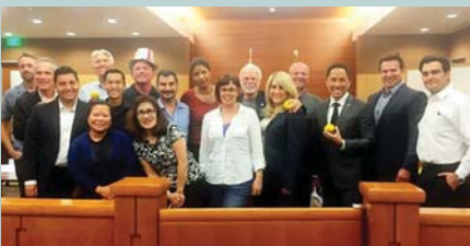
EVA Board of Trustees

The East Village Business Improvement District is partially funded by the City of San Diego's Small Business Enhancement Program.