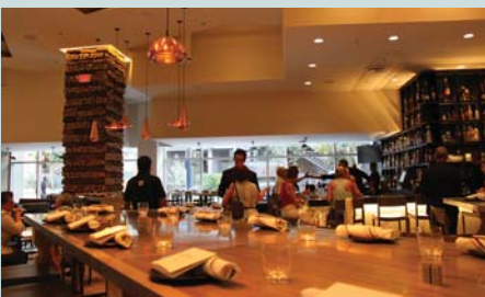
Bottega Americano opens in East Village