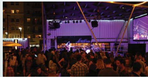
Grand Opening of Quartyard.