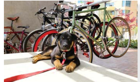
East Village, dog and bike-friendly by Ray Faketty