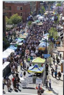
2015 East Village Opening Day Block Party.