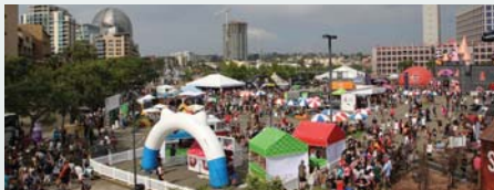
2014 Comic-con