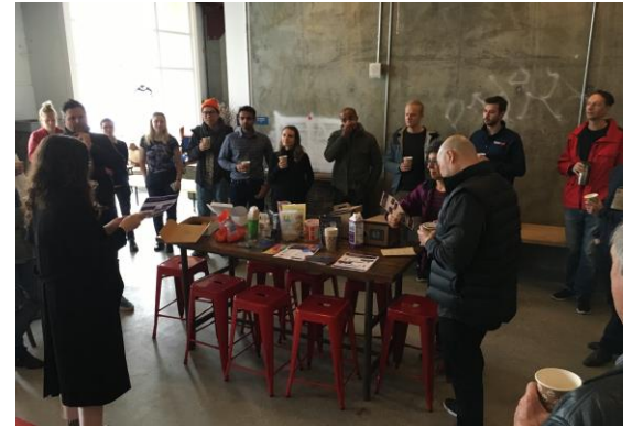
Jack London February Business Coffee at Crooked City Cider, DOT Gathering Merchant Feedback on Broadway Repaving

Jack London Improvement District in special Port of Oakland edition of the Oakland Business Review