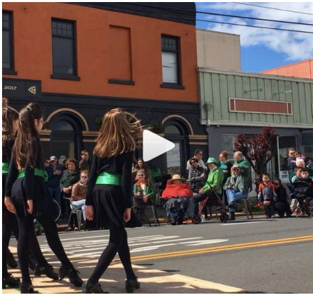
2018 St. Patrick's Day Block Party 2 nd and Broadway