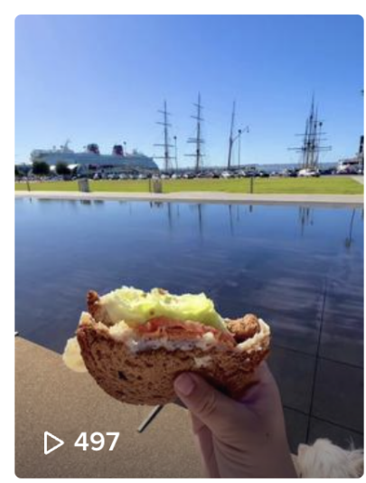
This is your sign to go on ...