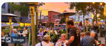
Sep 23, 2022 · Little Italy

Al fresco sunsets 🌅: Buon Appetito Restaurant