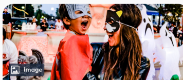
Oct 3, 2022 · Little Italy San Diego