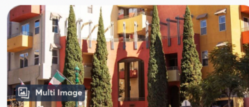
Sep 27, 2022 · Little Italy