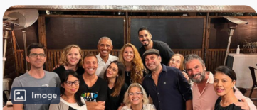
Sep 27, 2022 · Little Italy

Best performing content published during the selected period.