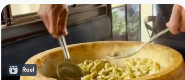
Oct 4, 2022 · Little Italy San Diego

Best performing content published during the selected period.