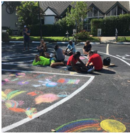
Lighthouse ArtCenter, Tequesta, Florida, 2017.

Experiments in Public Art is a program of ongoing projects across the city which are temporary in nature, responsive to community needs, and interactive/participatory. It generates opportunities for creatives to experiment and communities to engage. This year's program partners with FARM TO SPACESHIP , a local arts accelerator program, to focus on COVID Rebound and community connection through experiences. The program will focus on pandemic recovery through relationship building and experiential, interactive, and temporary public artworks.