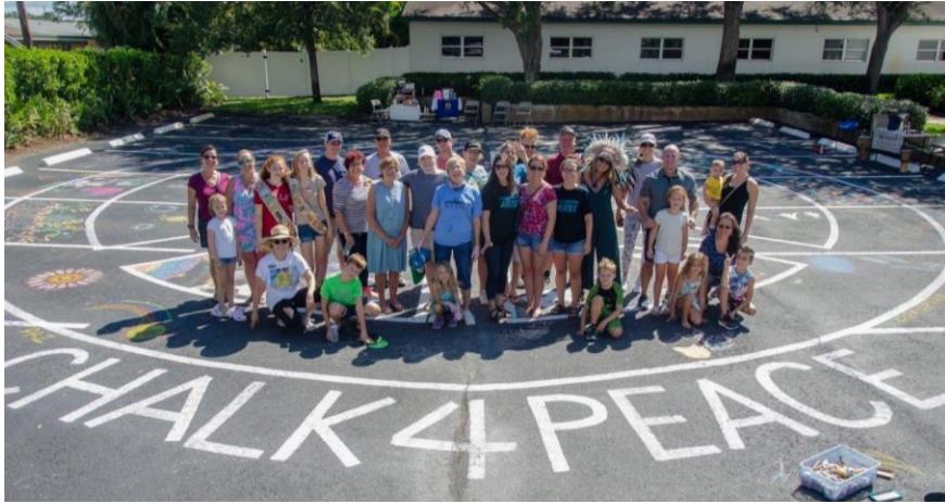
Previous event at the Lighthouse ArtCenter, Tequesta, Florida, 2017.