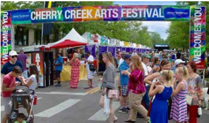
Cherry Creek Arts Festival