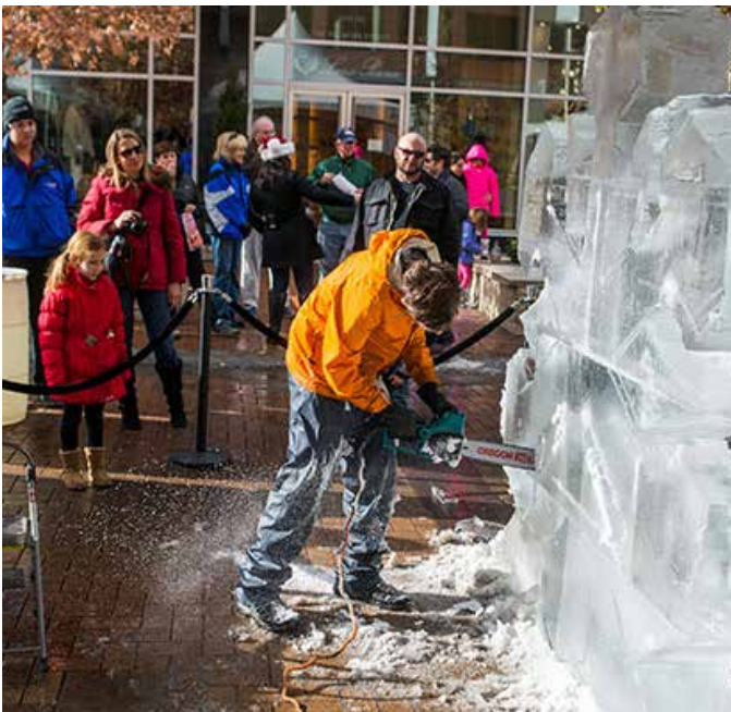
Cherry Creek North - Winter Fest - Ice Carving