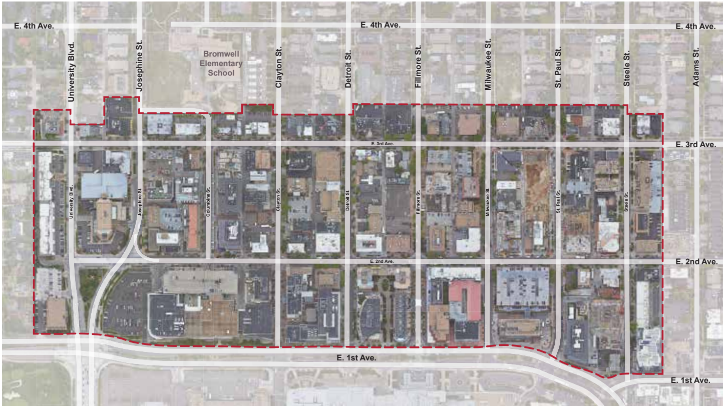
Map of Cherry Creek North Business Improvement District (CCN BID)

Cherry Creek North (CCN) is an active, walkable, mixed-use district embedded within the fabric of Cherry Creek neighborhoods. It spans 16-blocks from 1st Avenue to 3rd Avenue, and from University Boulevard to Steele Street. Its special character is defined by the quality of the public realm and its outdoor, pedestrian-friendly shopping environment.