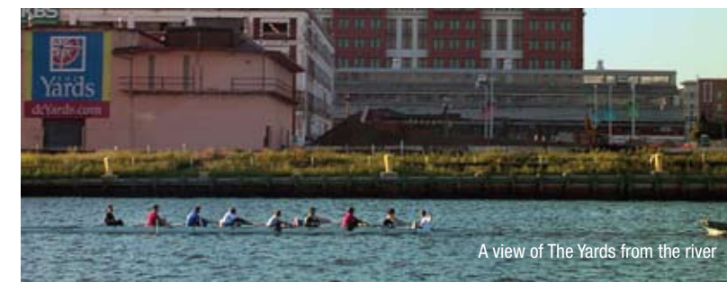
A view of The Yards from the river

Unwind or recharge with nature in the Capitol Riverfront, a place for an active and healthy lifestyle. The 20-mile riverwalk trail will be a pedestrian and bicycle promenade providing spectacular views of the river and the city’s skyline. With four new public parks and piers for boat docking, the Front will provide exceptional river access, open space, and recreational amenities.