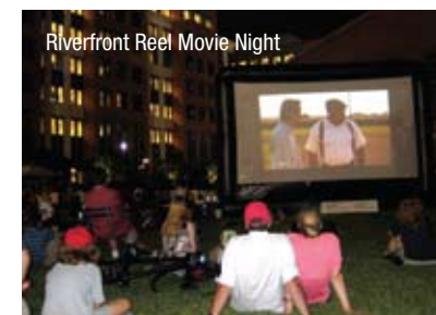
Riverfront Reel Movie Night

The Capitol Riverfront is a vibrant mixed-use neighborhood and riverfront destination. The Front has already established itself as a forward-thinking business center and growing residential neighborhood with wide appeal. Renovated brick warehouses and newly completed buildings create the Front’s new retail districts for dining, shopping and outdoor cafes. Plus, in the Capitol Riverfront you have a front row seat to lunchtime concerts, a farmers market, movies, rooftop happy hours, Artomatic and Nationals Park. And in the Front you have easy access to the rest of downtown and the region’s attractions.