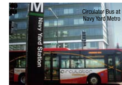
Circulator Bus at Navy Yard Metro

The Front is conveniently and centrally located. Sharing it’s northern border with Capitol Hill, the Front is five blocks south of the US Capitol Building and west of the Barracks Row restaurant district. The Front is easily accessible with direct connection to I-395 and I-295; Metrorail’s Green line at the Navy Yard Station or Blue/Orange Lines at the Capitol South Station; and the Circulator Bus linking to Union Station and the Red Line. Reagan National Airport is only a 10-minute drive away and the Front is part of several regional bicycle routes and trails.