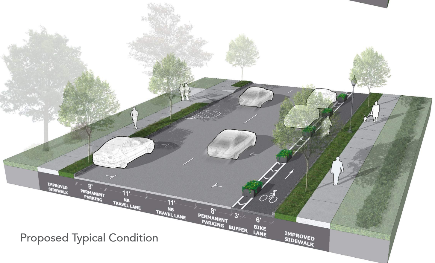
Proposed Typical Condition