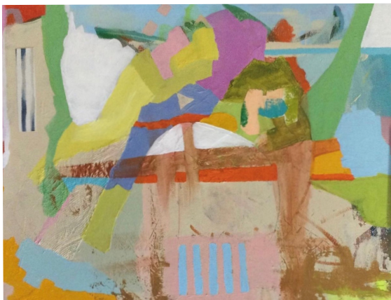
Arches by Jude Robinson at Dilworth Artisan Station

The “Flip the Switch” preview takes place on Friday, February 2. Live music and entertainment begin at 6:30 p.m. and we'll flip the switch at 7 p.m. For artist bios and more festival details, visit southendclt.org/rail-trail-lights