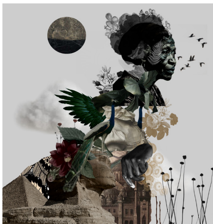
Foundation by Levi Robinson at Elder Gallery of Contemporary Art (Currently on view in “Recalibrate”)

Explore South End's vibrant mural scene featuring 10 captivating artists showcased on our website, and don't miss out on guided tours by checking @ArtWalks for upcoming dates.