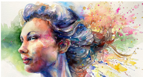
Inspired by Eva Crawford Art at Dilworth Artisan Station

Explore South End's vibrant mural scene featuring 10 captivating artists showcased on our website, and don't miss out on guided tours by checking @ArtWalks for upcoming dates.