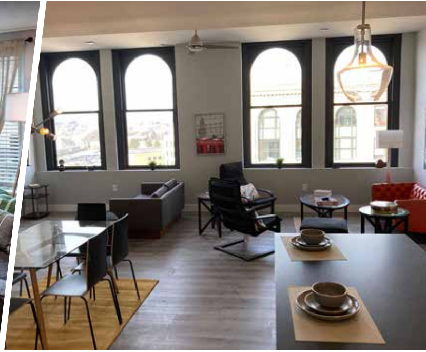
interior: The 159 Main, 159 S. Main St., 330-752-6794