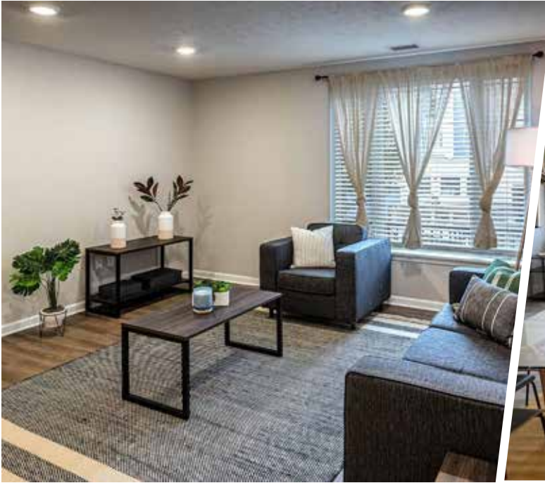
interior: The Standard, 22 E. Exchange St., 330-375-1183