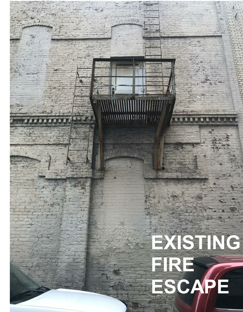
EXISTING FIRE ESCAPE