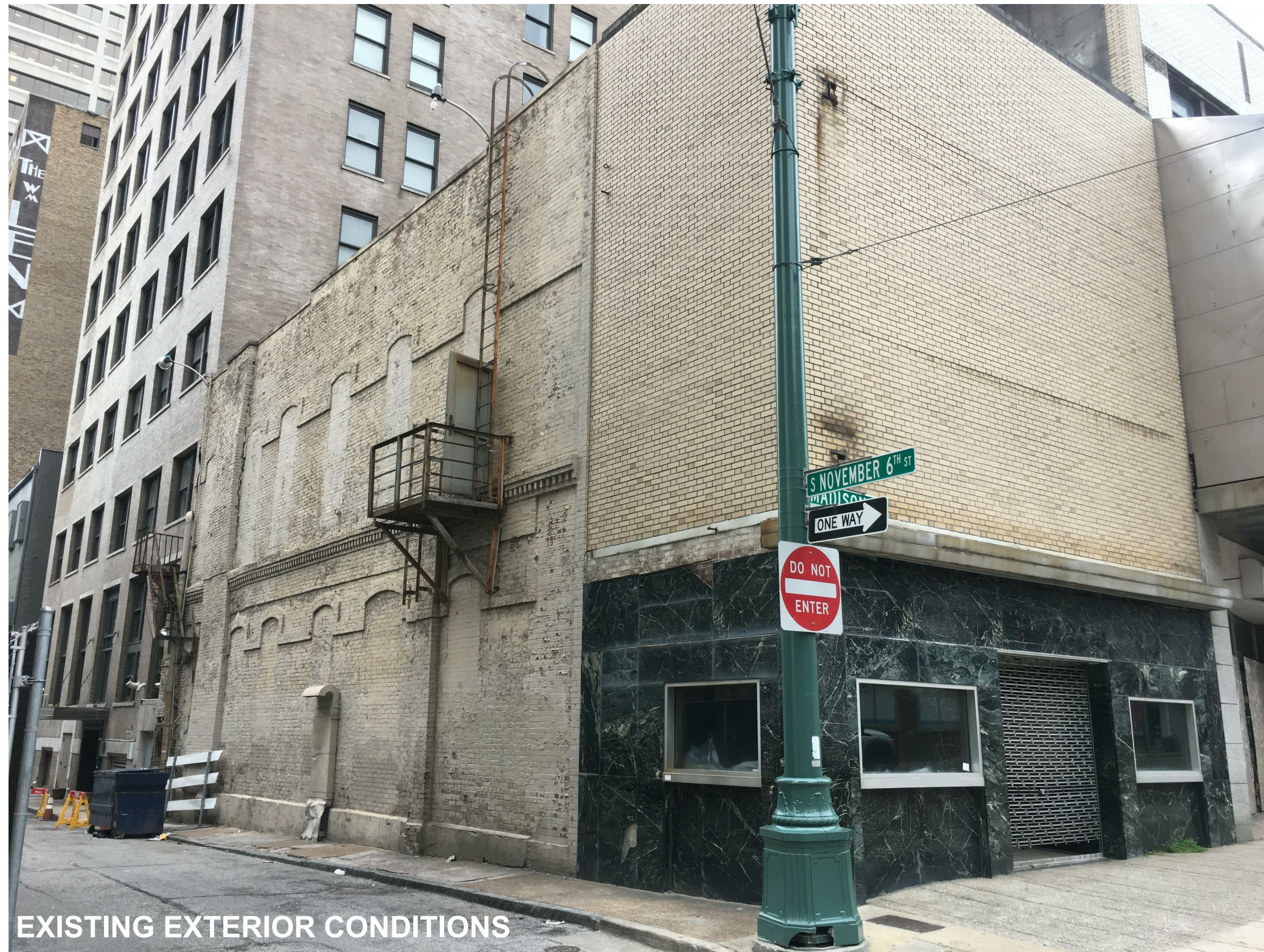
EXISTING EXTERIOR CONDITIONS