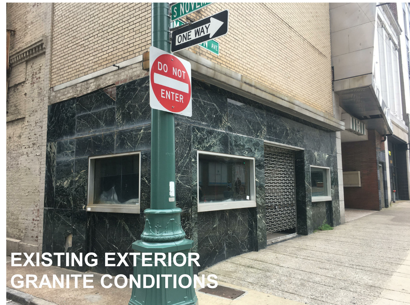
EXISTING EXTERIOR GRANITE CONDITIONS