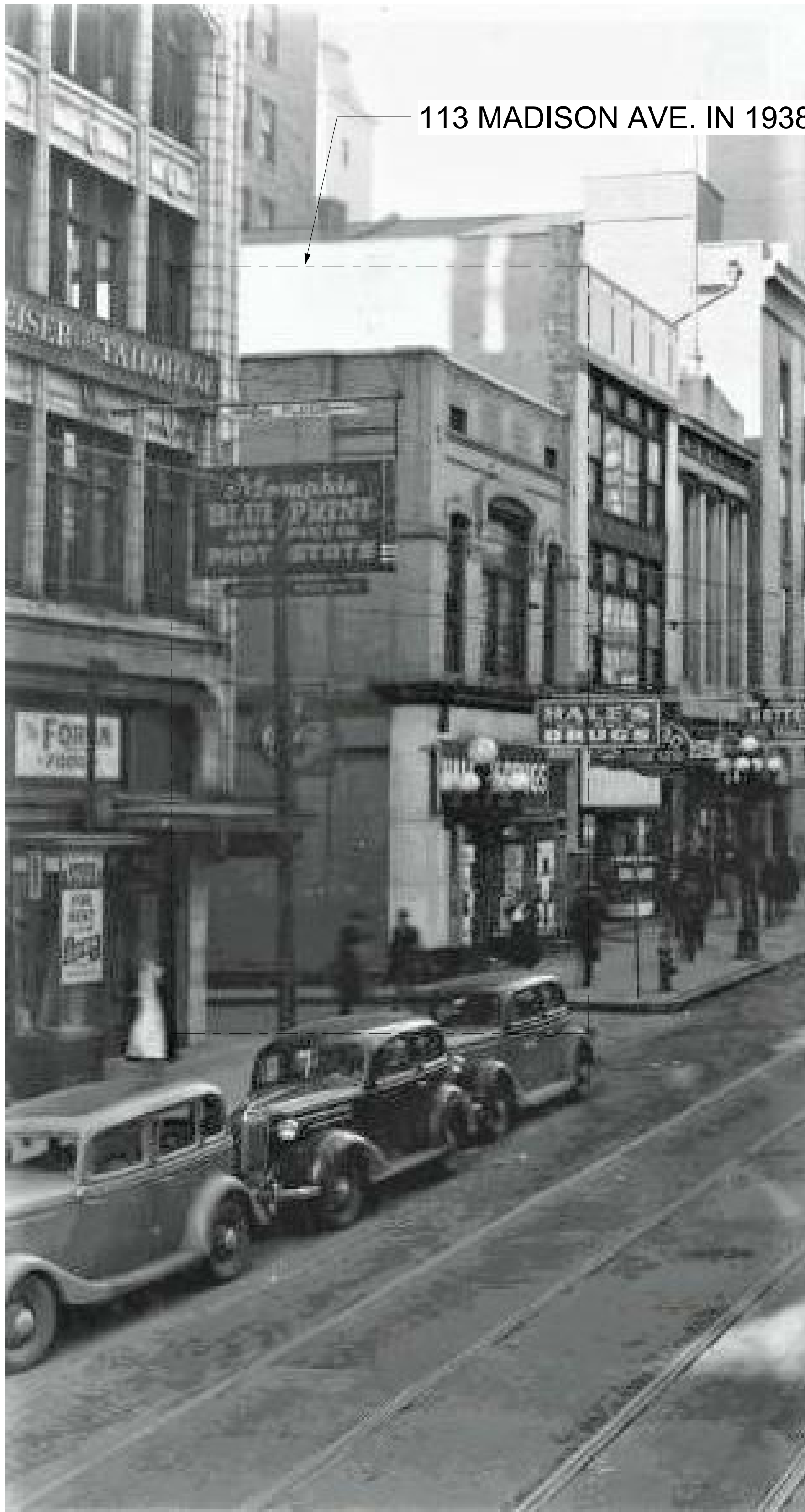
113 MADISON AVE. IN 1938