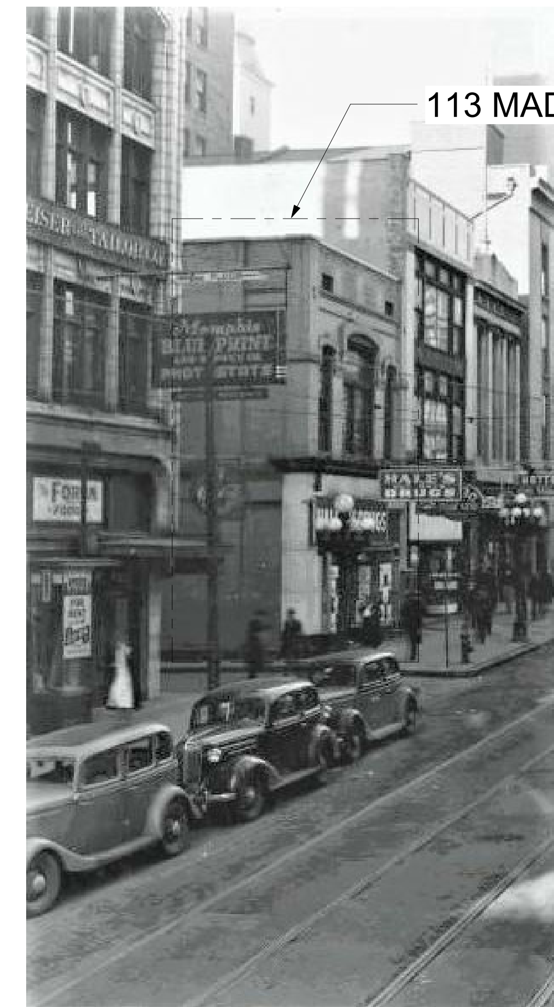
113 MADISON AVE. IN 1938