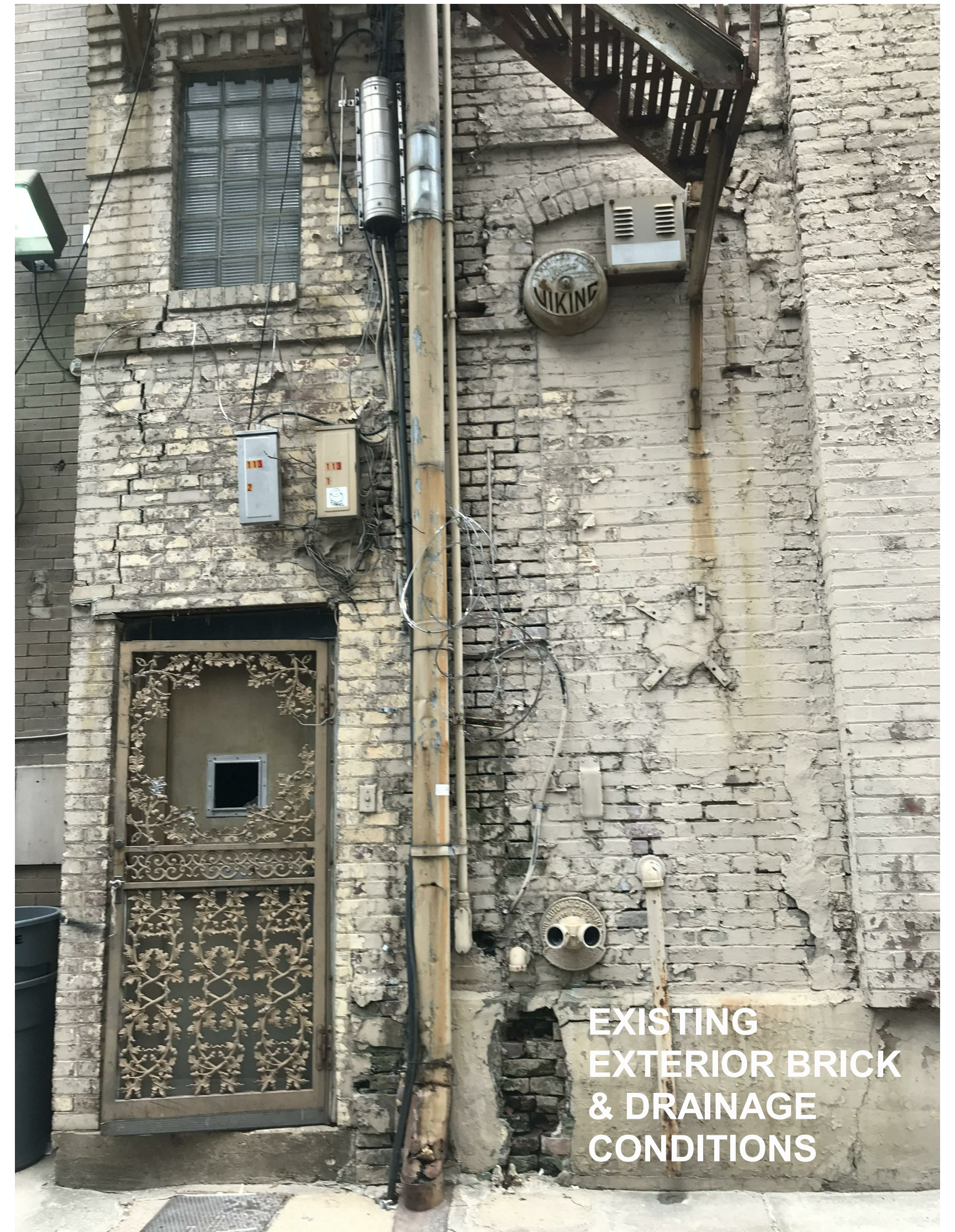
EXISTING EXTERIOR BRICK & DRAINAGE CONDITIONS