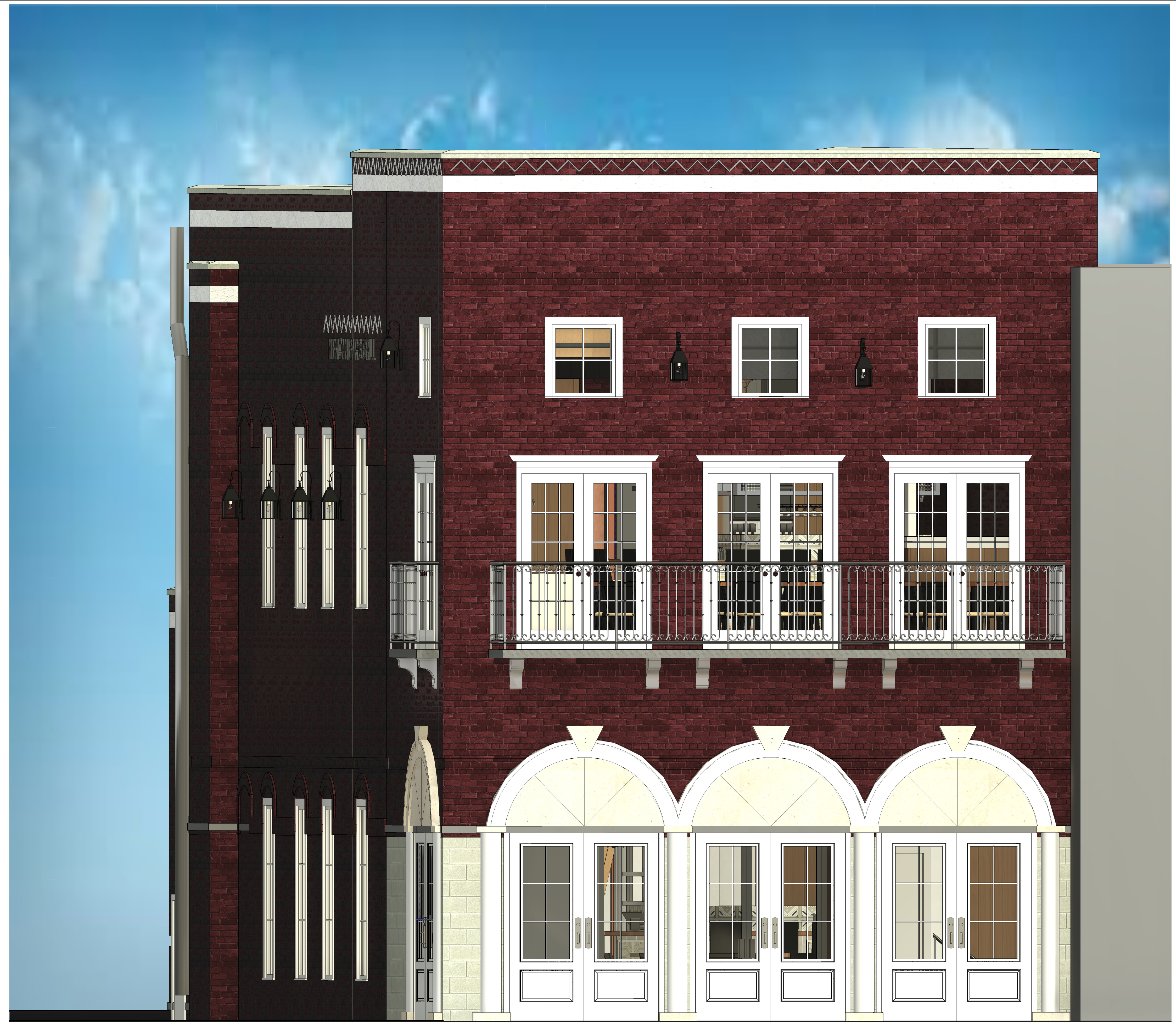
NEW PROPOSED EXTERIOR

S. BERRY JONES ARCHITECTS DMC DESIGN REVIEW BOARD DATE: 9/25/20 SCALE: 1" = 80'-0"