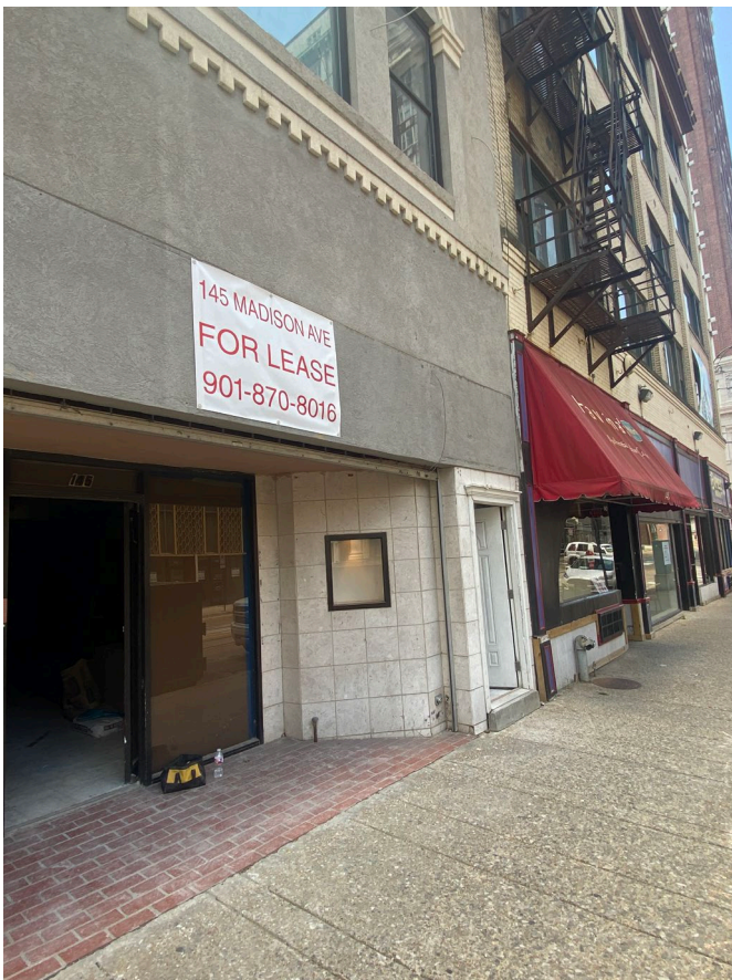
Left: Formerly Havana's Pilon (143 Madison)