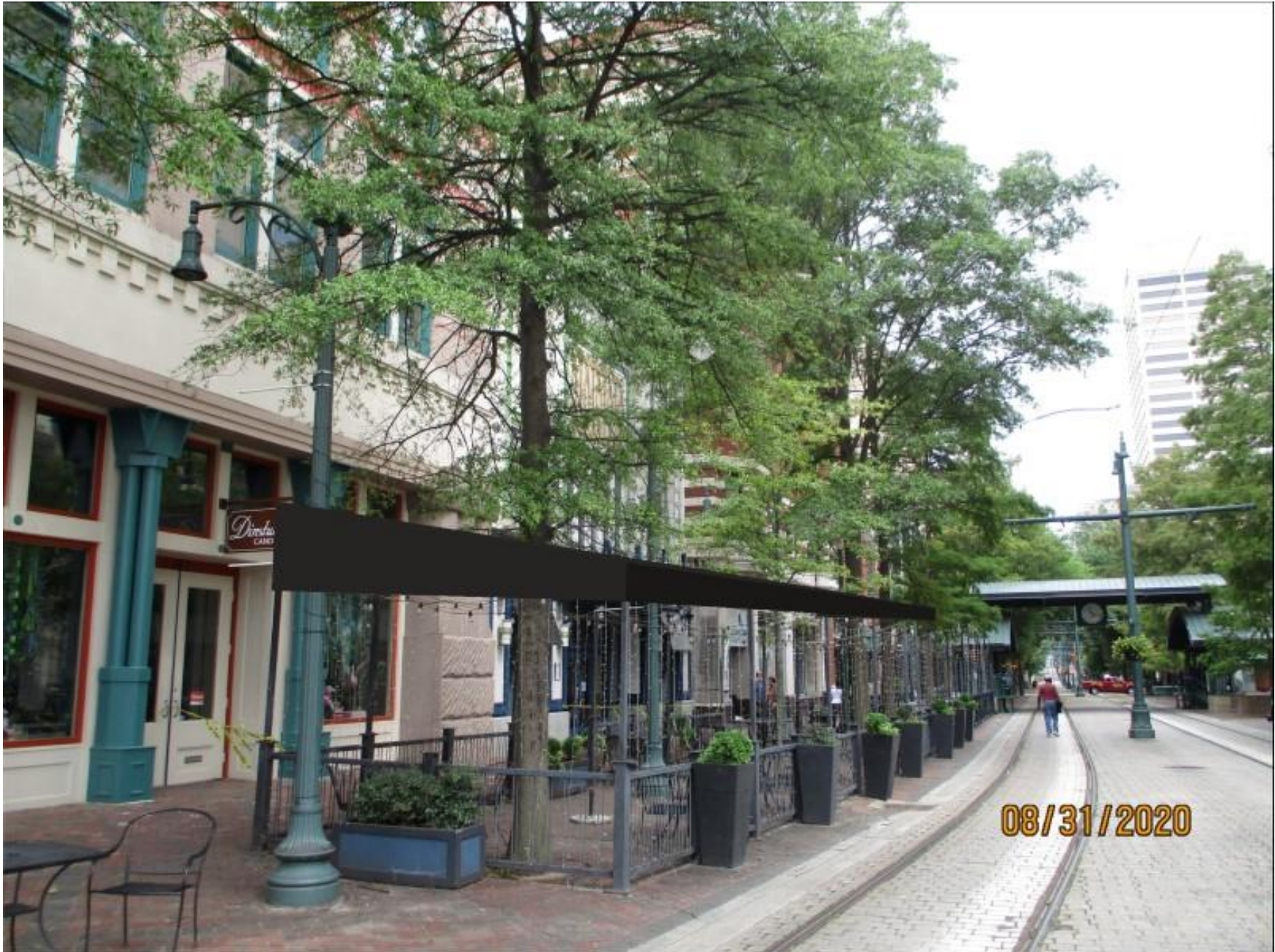
Proposed location & shape of new awning – white & black stripes planned