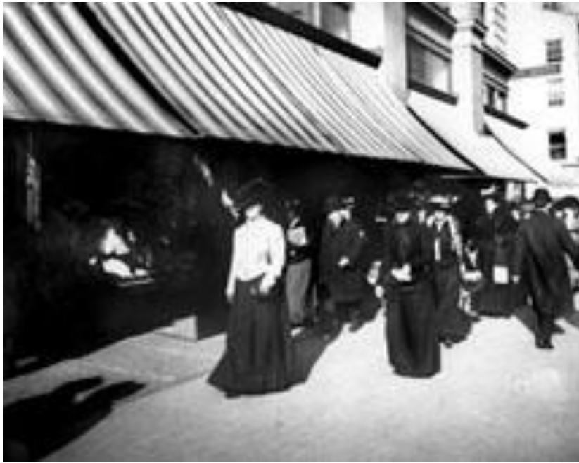
Historic photo of a nearby property illustrating a similar black & white striped design proposed for use at the Majestic Grille.