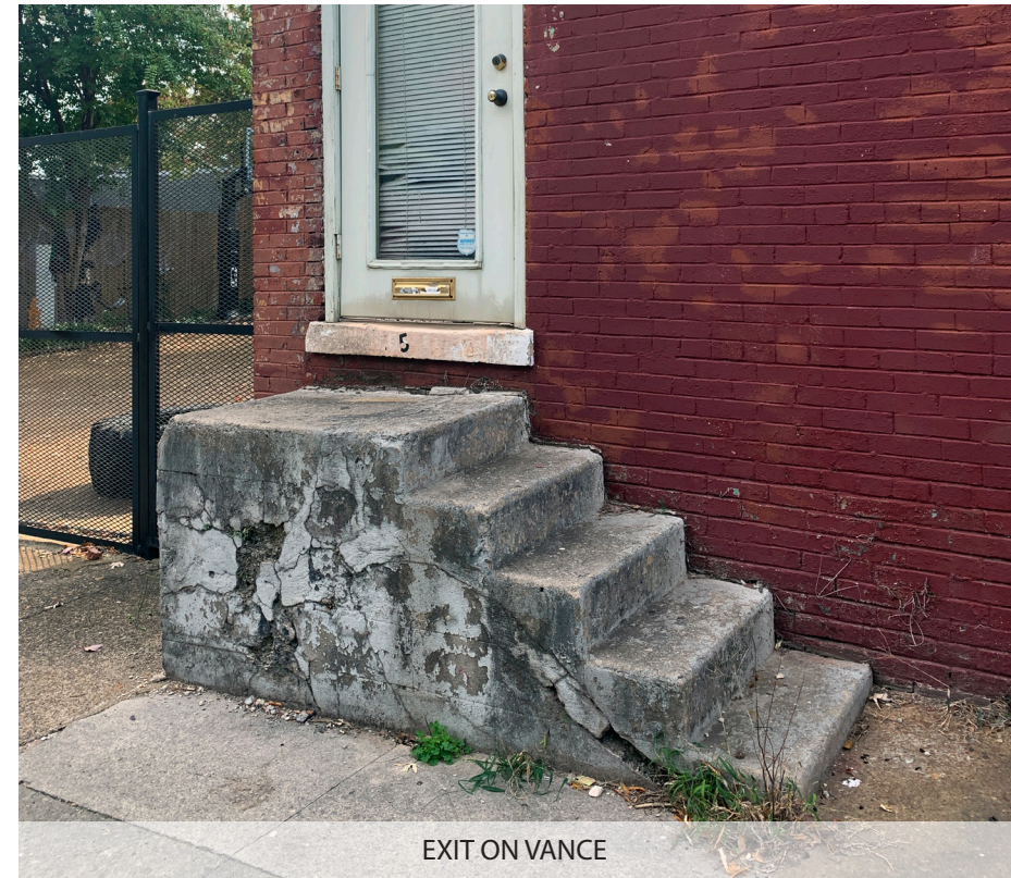
EXIT ON VANCE