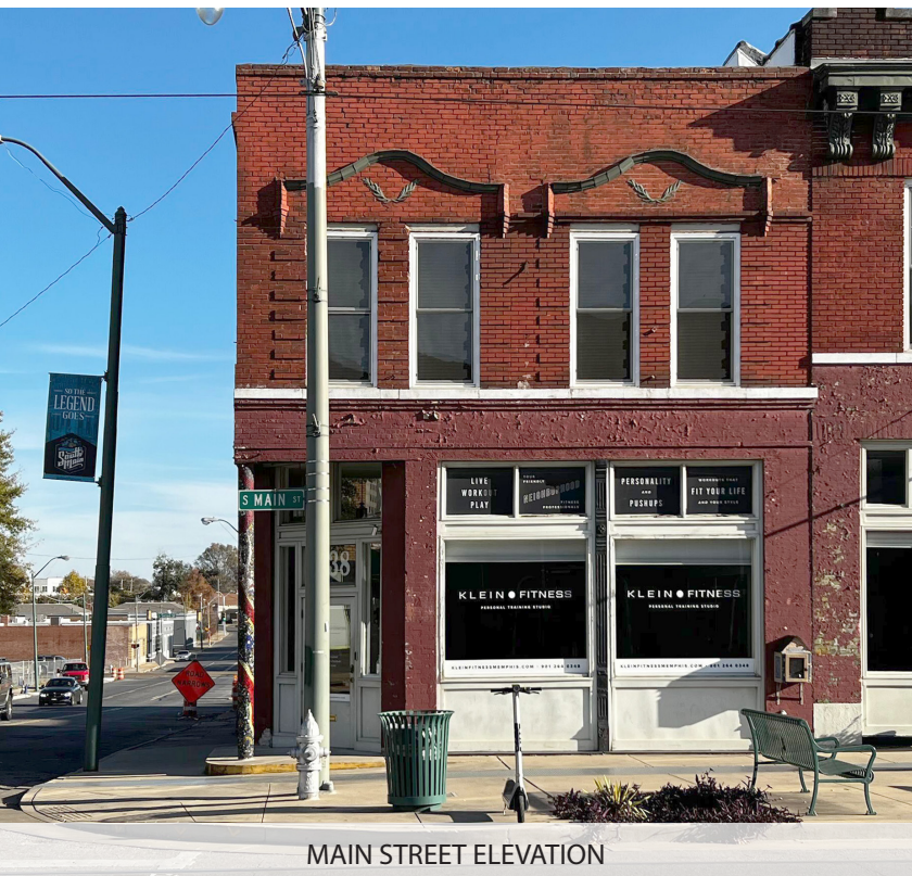
MAIN STREET ELEVATION