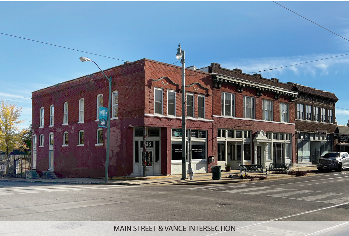
MAIN STREET & VANCE INTERSECTION