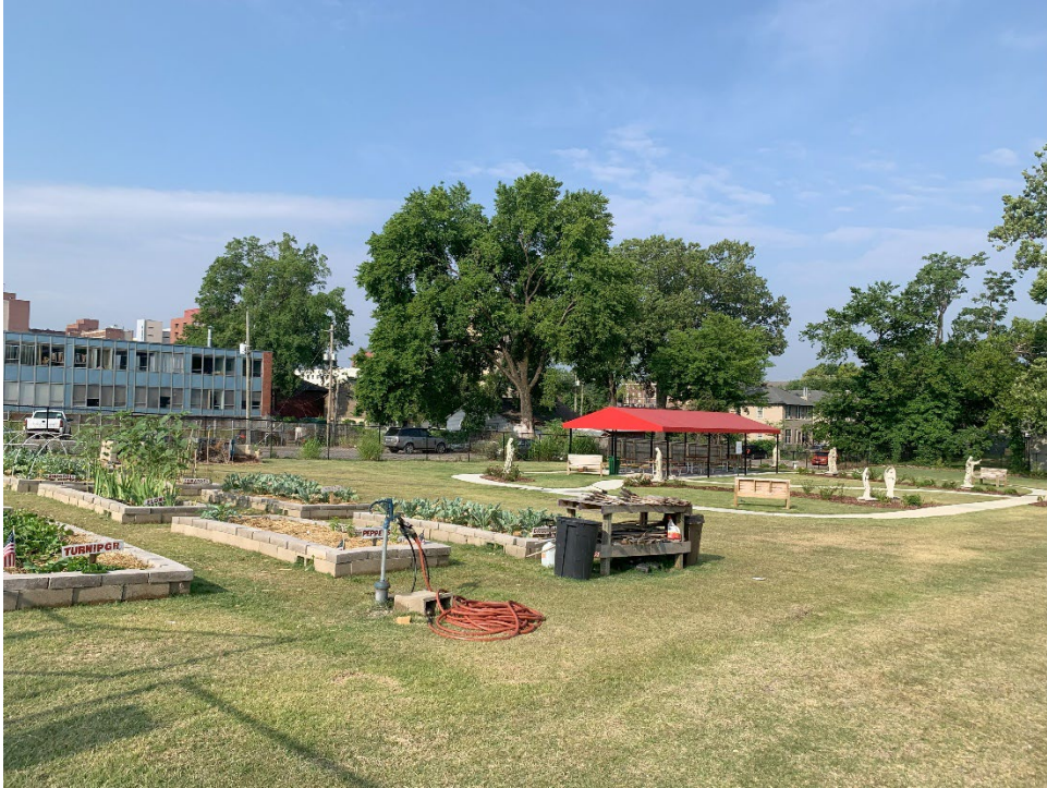
Drinking & Filling Station