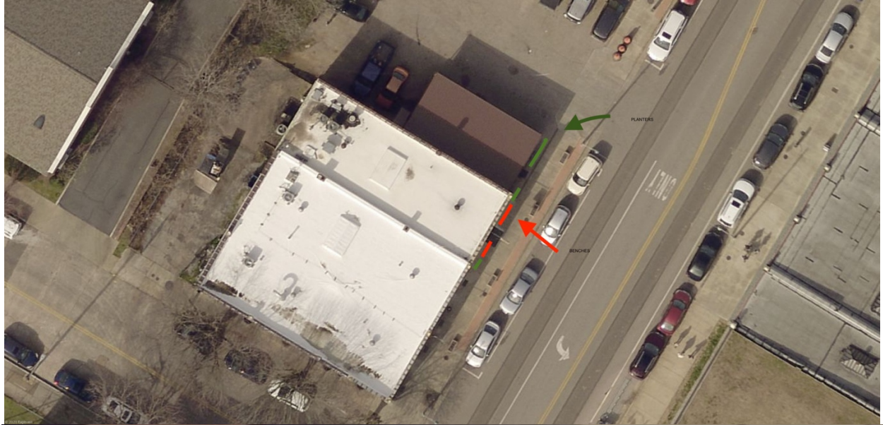
Aerial view of property showing placement of benches and planters.