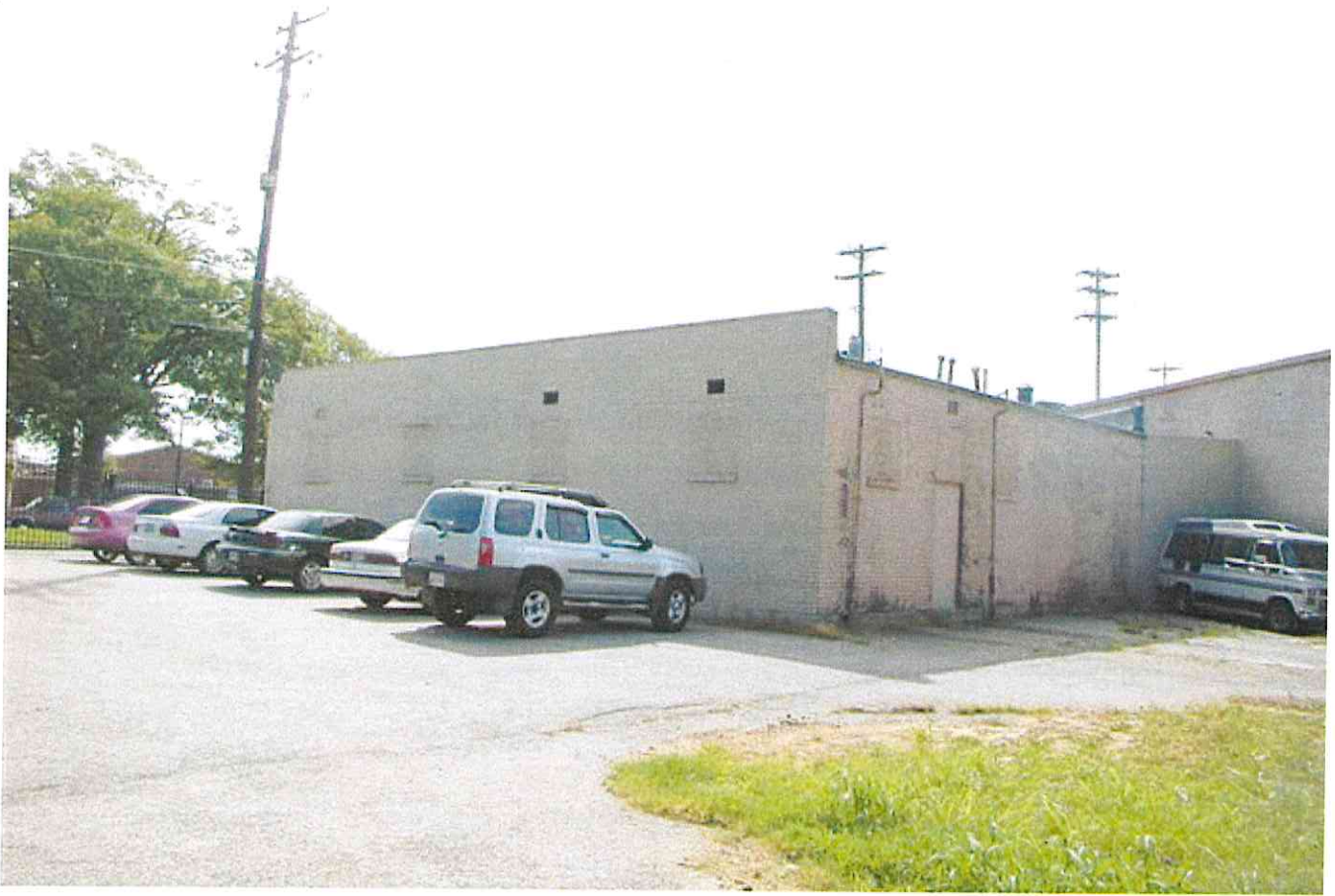
REAR 653 Mississippi.