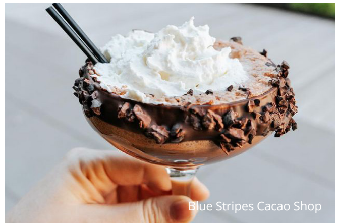
Blue Stripes Cacao Shop

Businesses may be subject to temporary closures due to COVID-19 concerns and the Christmas Day attack. Eighteen retailers have closed due to COVID-19, and 54 retail and restaurants were affected by the explosion on Second Avenue.