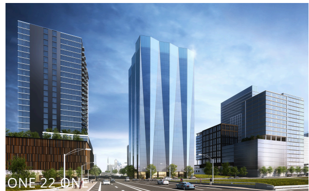
ONE 22 ONE