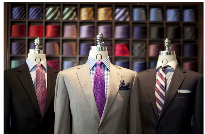
Q Clothier: 401 11th Ave South