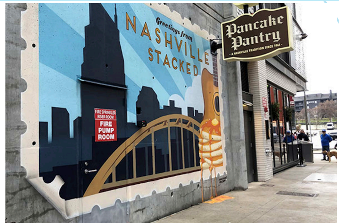
Pancake Pantry: 220 Molloy Street

Retail Vacancy Rate: 3% Total Retail Downtown SF: 3.6 million