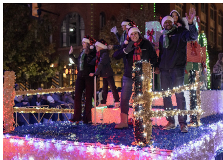
Sponsor GM Financial